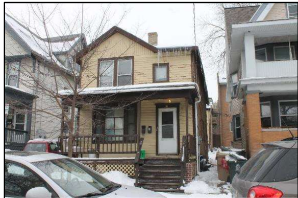
12 North Franklin Street