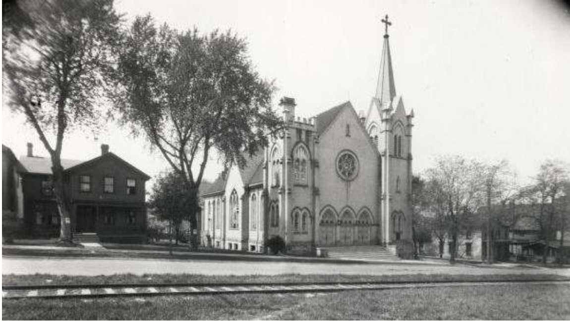
Photograph of St. John's Lutheran Church taken from the south, 1918. On file at the Wisconsin Historical Society Library and Archives. The house across Hancock Street on the left side of the photo are the subjects of this report.