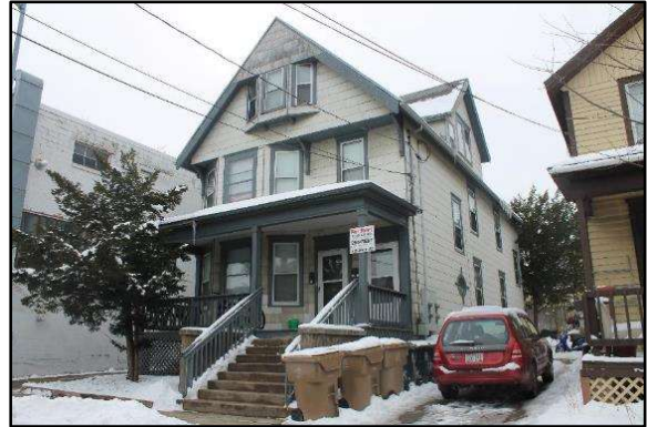
8-10 North Franklin Street