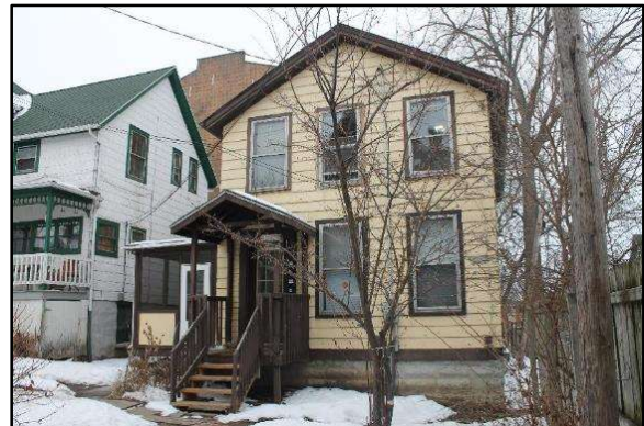
410 1/2 East Washington Avenue

The vernacular front-gabled house at 410 1/2 East Washington Avenue was moved to its present site behind 410 East Washington Avenue in 1907 by Emil and Ida Frautschi. It is unknown at this time where the house came from and who built it; however, it appears that it is small vernacular balloon-frame structure from the second half of the nineteenth century and was likely located elsewhere in the city. It was not the older home of the Frautschi family. It does not match the older wood house that was demolished at the 410 East Washington Avenue address in its scale or proportions. The house was originally used as a rental property when it was moved to the site. A large porch was added as a wing in the 1910s. Jonathan and Ida Makuson, a concrete mixer and contractor, rented the house until 1924, while it was owned by the Frautschi family. It has since been divided into two units and remains apartments. 6