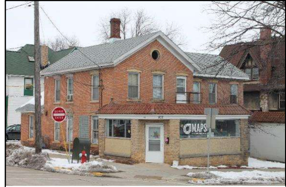
402-408 East Washington Avenue