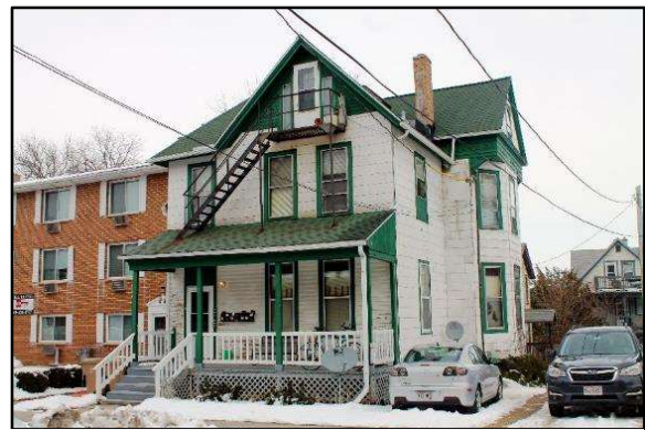
9 North Hancock Street