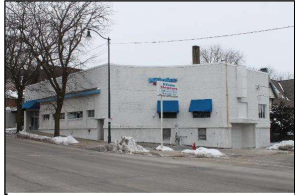
412-414 East Washington Avenue

The industrial warehouse at 412-414 was constructed in 1924 as the Gillespie Motor Sales Company showroom and garage. Previously, the site was occupied by two non-extant wood frame houses. Gillespie Motor Sales specialized in Packard, Paige, and Jewett brand automobiles and transitioned into the Damsin Auto Service Company and the Christiansen Motor Company in the late 1930s. In 1942, the building was purchased by the Manchester Inc. Service Co., a dry-cleaning business, and the building was extensively renovated in 1948. Much of the property was used as a clothing warehouse at that time. The building briefly served as a Social Security Administration office and garage from 1954 to the 1958, when it was purchased by the Madison Steam Dye Works. The Madison Steam Dye Works was an established Madison dry-cleaner and went out of business in 1986. The building was then purchased by the Klinke Cleaners chain, which has operated at the 412-414 East Washington Avenue to the present. Actual dry-cleaning processes and storage have not been located on the property for the last two decades. 7