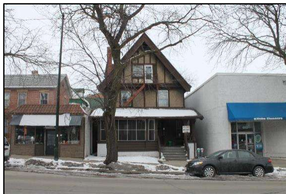
410 East Washington Avenue