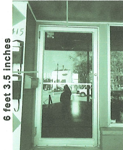
signable area 3 feet