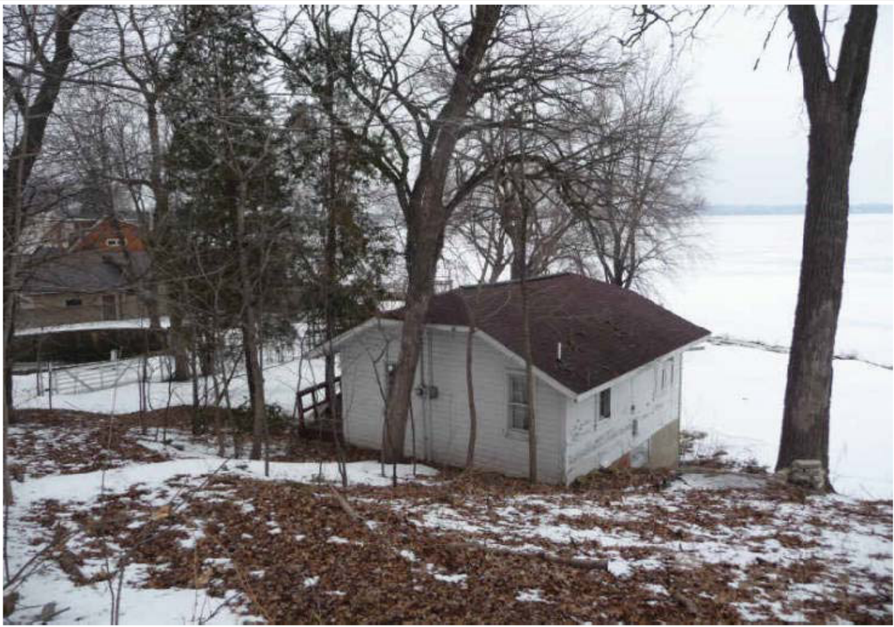
REAR VIEW OF SUBJECT PROPERTY

Appraised Date: March 7, 2011 Appraised Value: $ 861,000