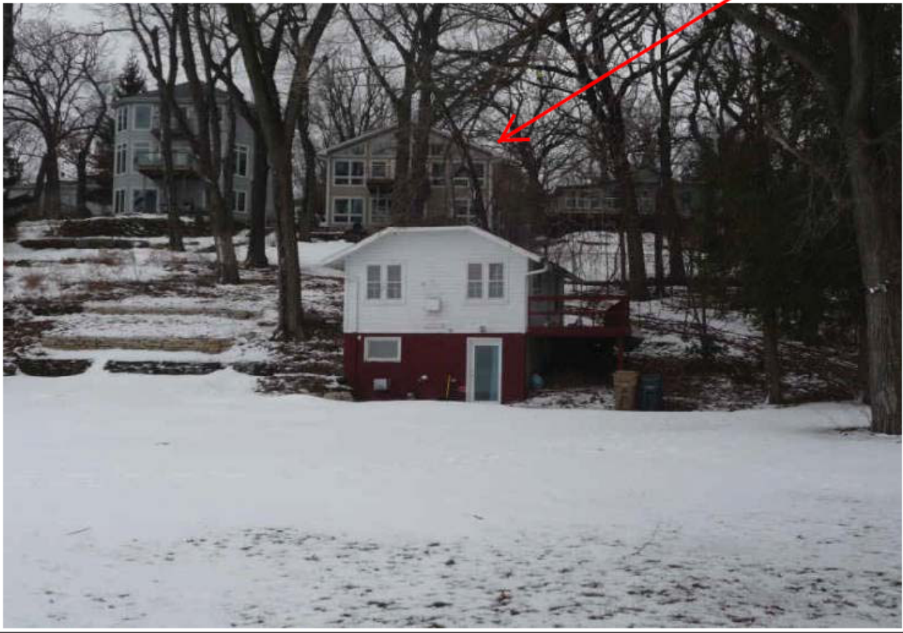
FRONT VIEW OF SUBJECT PROPERTY

Appraised Date: March 7, 2011 Appraised Value: $ 861,000