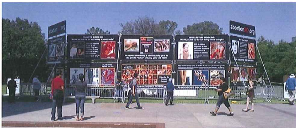
Figure 1. GAP display at the U of California at Riverside.

History of GAP. Over the 13-year history of this project, the GAP display has been erected more than 200 times at nearly 75 university campuses and at a number of urban locations all over the United States. There have been no incidents related to its construction. To our knowledge, there have been no complaints of any damage to grounds, facilities, or property.