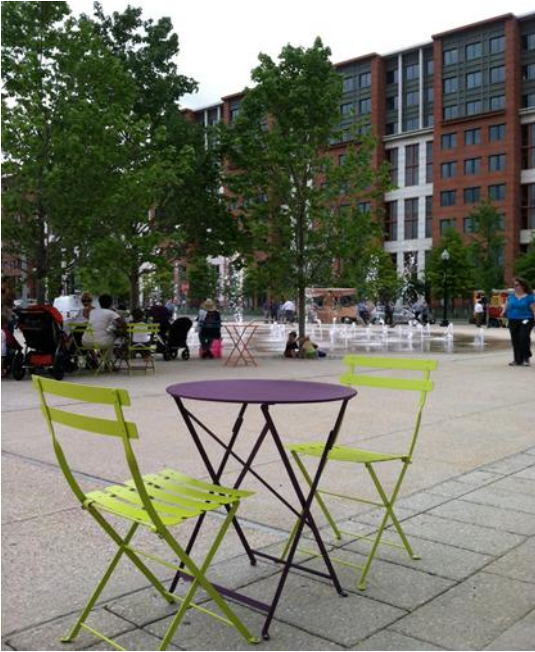
Summertime Play Area