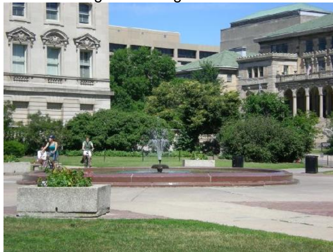
Library Mall Fountain

Wading Fountain. The spray pattern of the Library Mall water fountain and water conservation issues are long-standing problems. The fountain should be modified into a surface water feature which can act as the center piece for the ice skating rink during the winter.