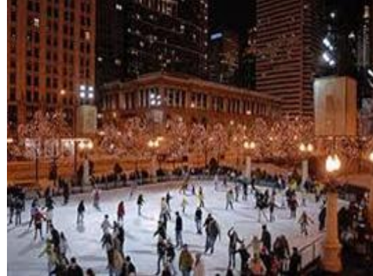
Millennium Park, Chicago

Extending the year-round public uses of the 700-800 Block of State Street & Library Mall, also benefit food cart vendors who would invariably sell hot food and drinks to the ice skaters and spectators.