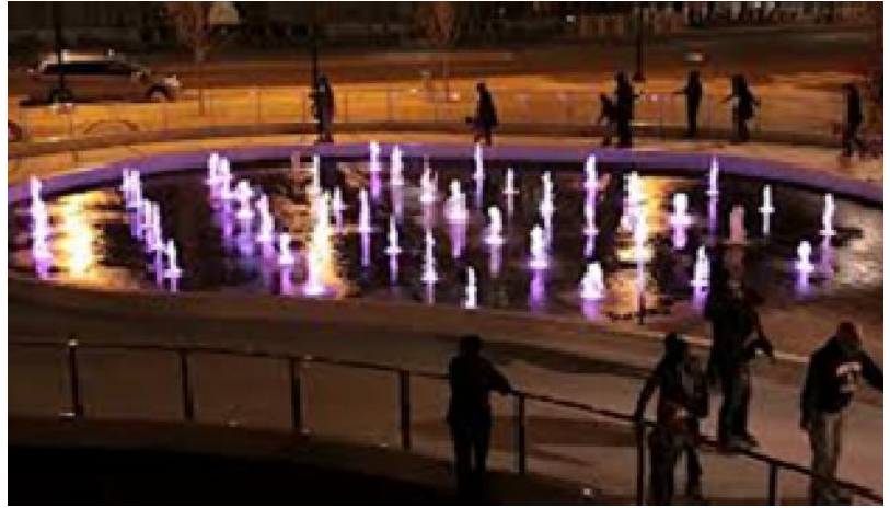
Winter Ice Rink