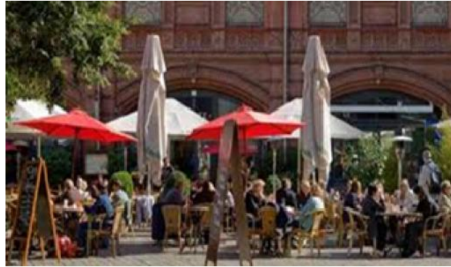
Mall with movable shade and seating structures