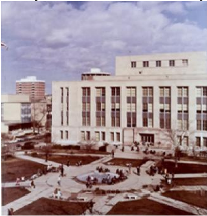
Library Mall without shade

incorporated into the project design, e.g. movable tables, umbrellas and chairs. Replacing the old and diseased trees and adding trees along the perimeter of the Library Mall will also add needed shady areas for visitors to enjoy the space.