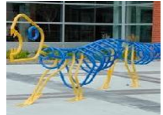
Creative Rack Systems

Installing bike racks in appropriate places is critically important. Currently, the consultants propose significant rack structures at entry points to the public space. The size and location of the proposed bike rack systems provide an opportunity to use their size and scope as a "welcoming" "creative" and "playful" gateway to the space. Designing the bike racks as more than mere functional structures adds to the attractiveness of the space and communicates Madison's commitment to bicycling as a convenient and popular mode of transit.