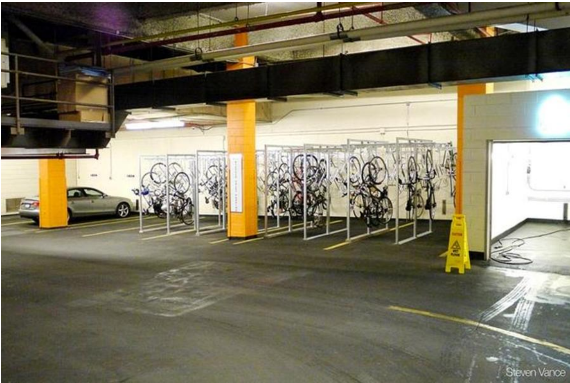
Bike Valet Rack System

At the University of Arizona in Tucson, the university's parking and transit services recently opened an on-campus, all-day bicycle valet service for students and employees. In Washington DC, fans going by bike to a Washington Nationals' baseball game can check their bikes at a valet service run by the park staff. The Nationals' bike valet is located inside the ballpark's parking ramp. The service is free although tips are encouraged. A similar service is offered at San Francisco Giants games by the San Francisco Bicycle Coalition. At Chicago's Willis Tower, the management company offers a bike valet service to people working in the office tower. The service is located in the underground parking garage.