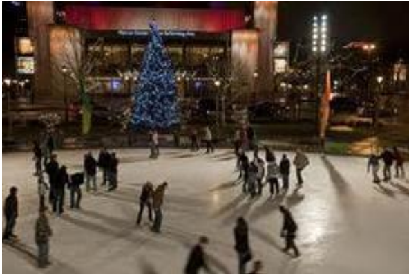
Arrow Park, Milwaukee

Similarly, Arrow Park in Milwaukee is also a small urban park whose size fits well into the space available for a potential rink in the Library Mall area. Millennium Park in Chicago, though much larger than the others, demonstrates the value that an urban ice skating rink can bring for year-round public space uses.