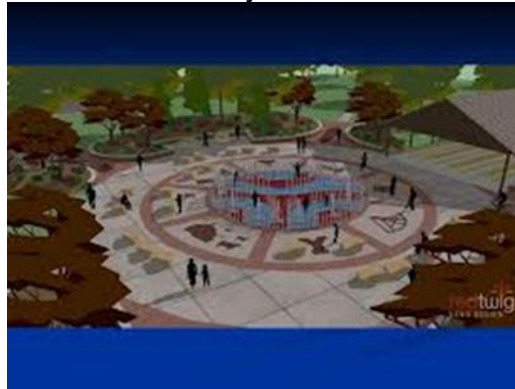
Pioneer Park Provo

Similarly, Provo, UT's Pioneer Park incorporates a splash pad water feature which provides a place for visitors to play in water on a warm summer's day. This design feature allows incorporation of historic and cultural designs relevant to the Library Mall.