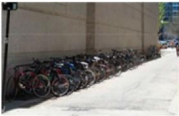
Current rack systems

Artistic Bicycle Racks. Bicycle parking on the 700 and 800 blocks of State Street is woefully inadequate and visually unsightly given the volume of bicyclists that visit the project area on a daily basis.