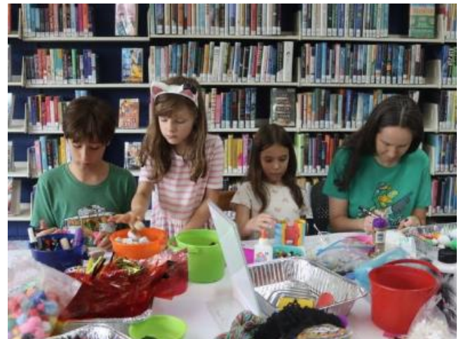
Pictured above: (left) WE READ summer map, (right) library program at Monroe Street Library.