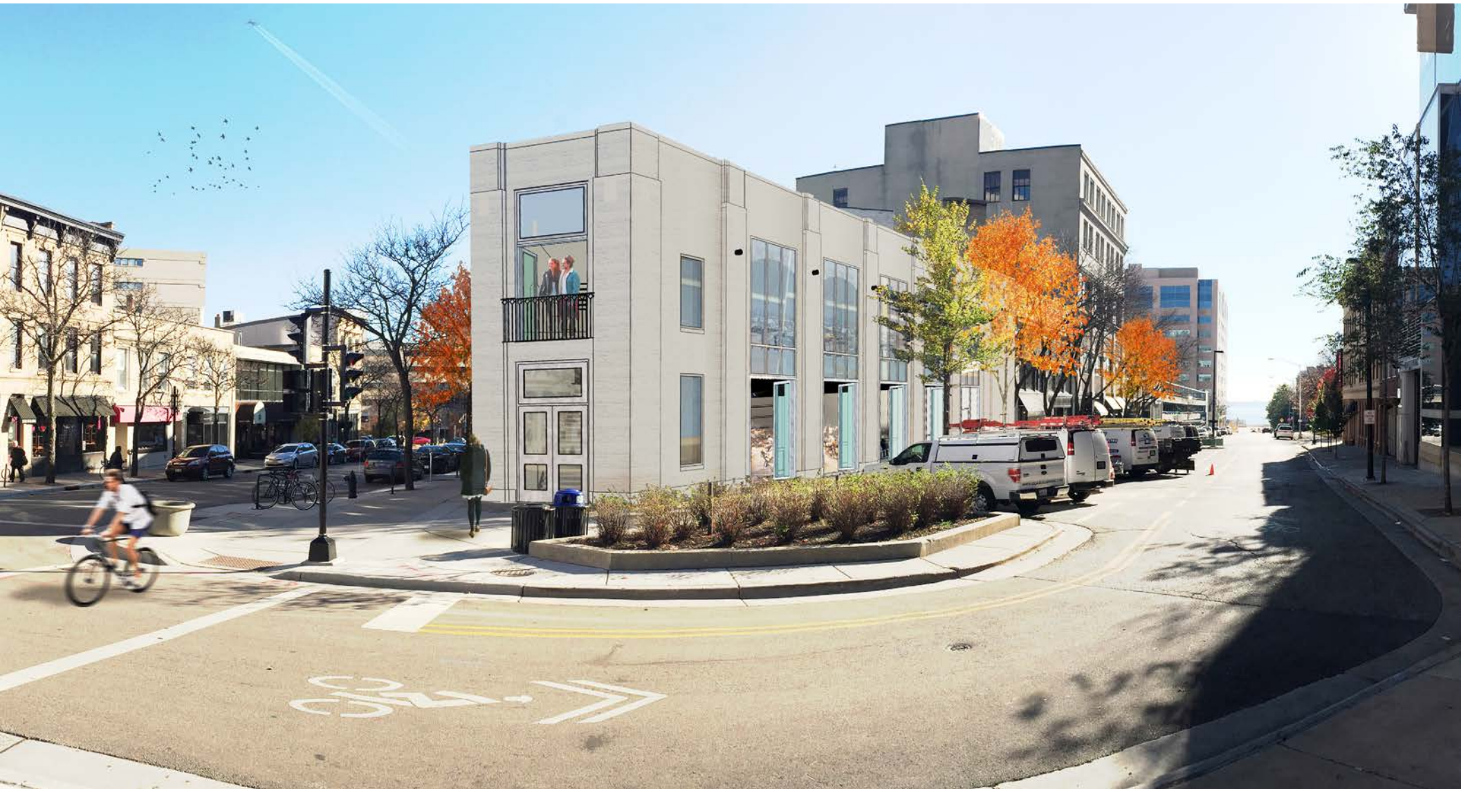
PINCKNEY STREET CORNER PERSPECTIVE