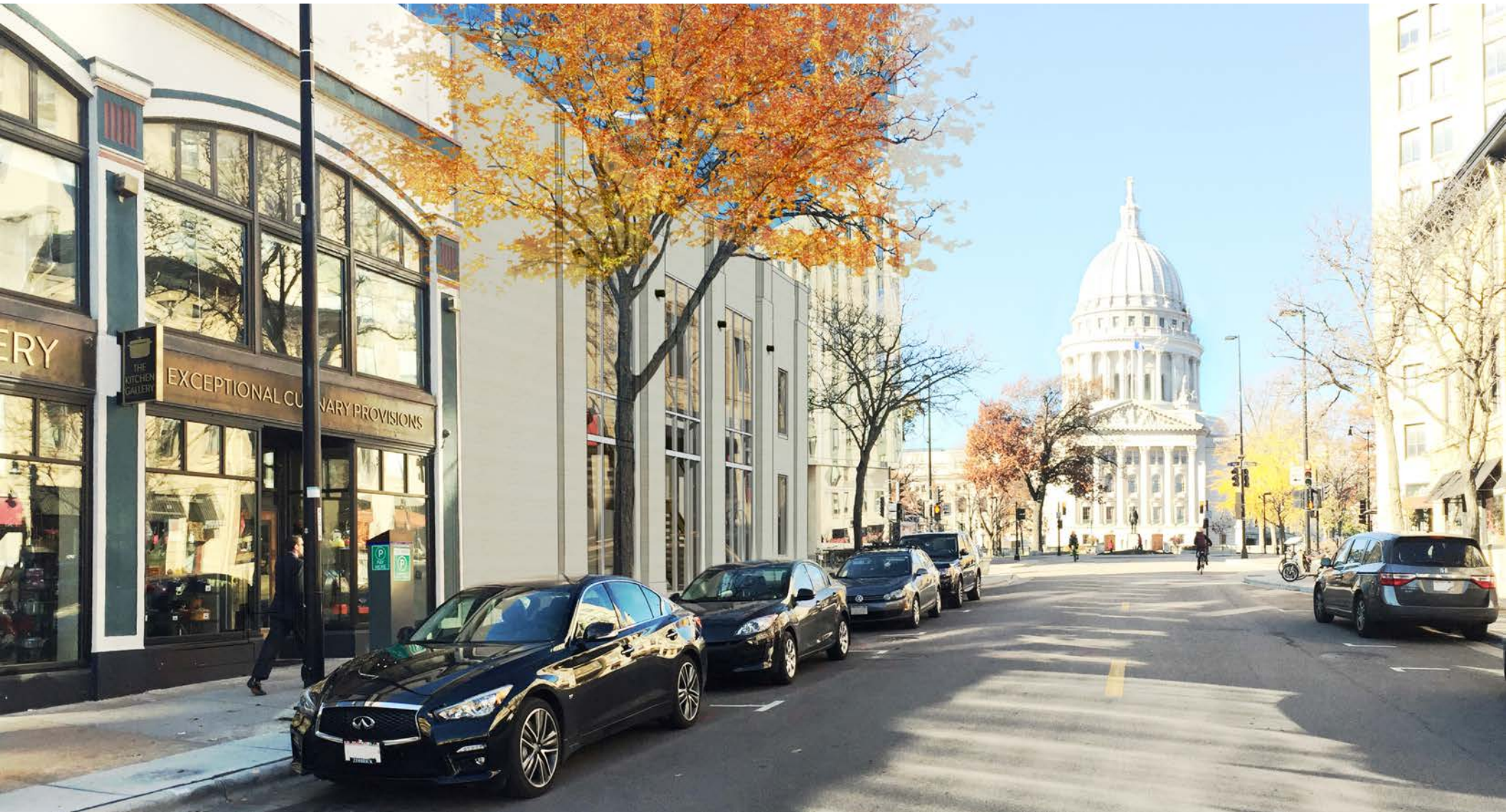
KING STREET CAPITAL PERSPECTIVE