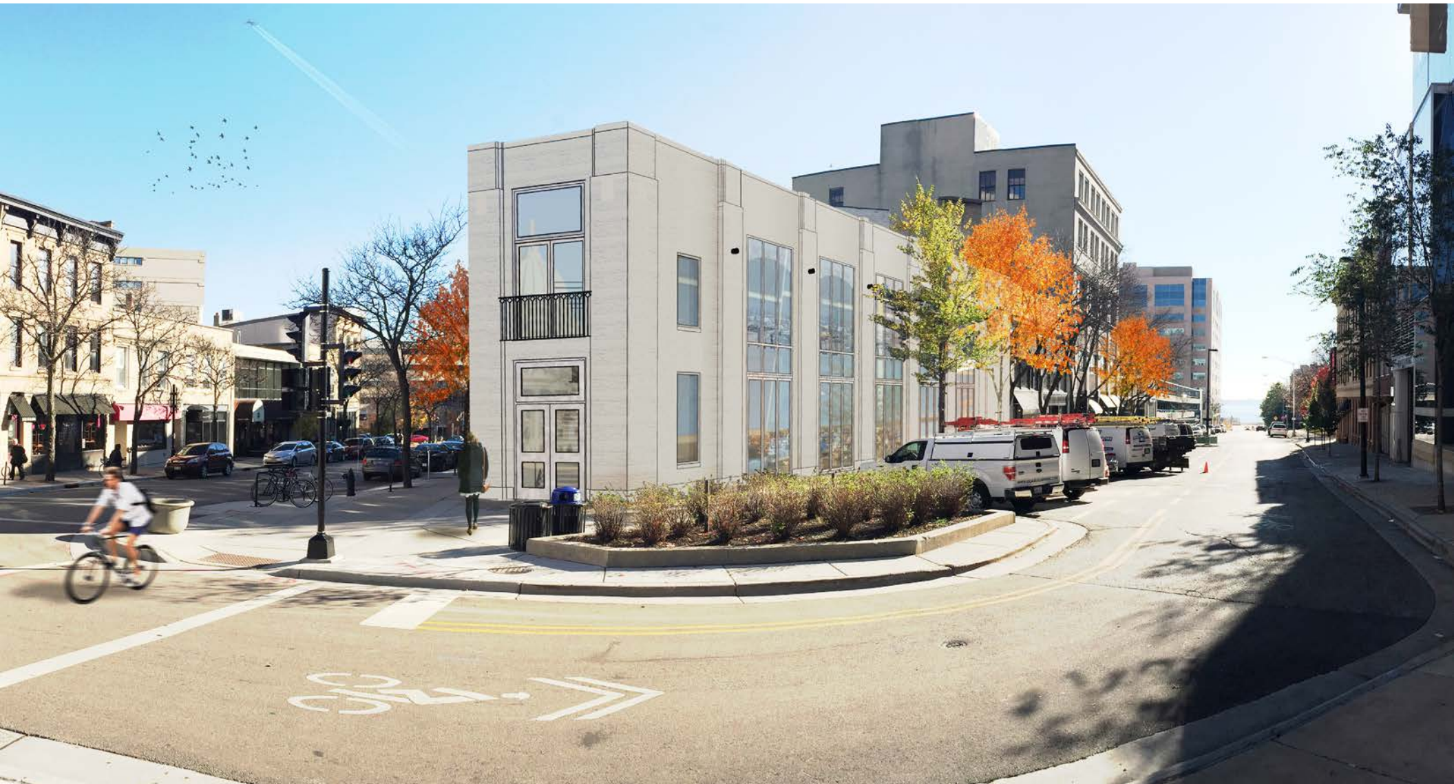
PINCKNEY STREET CORNER PERSPECTIVE