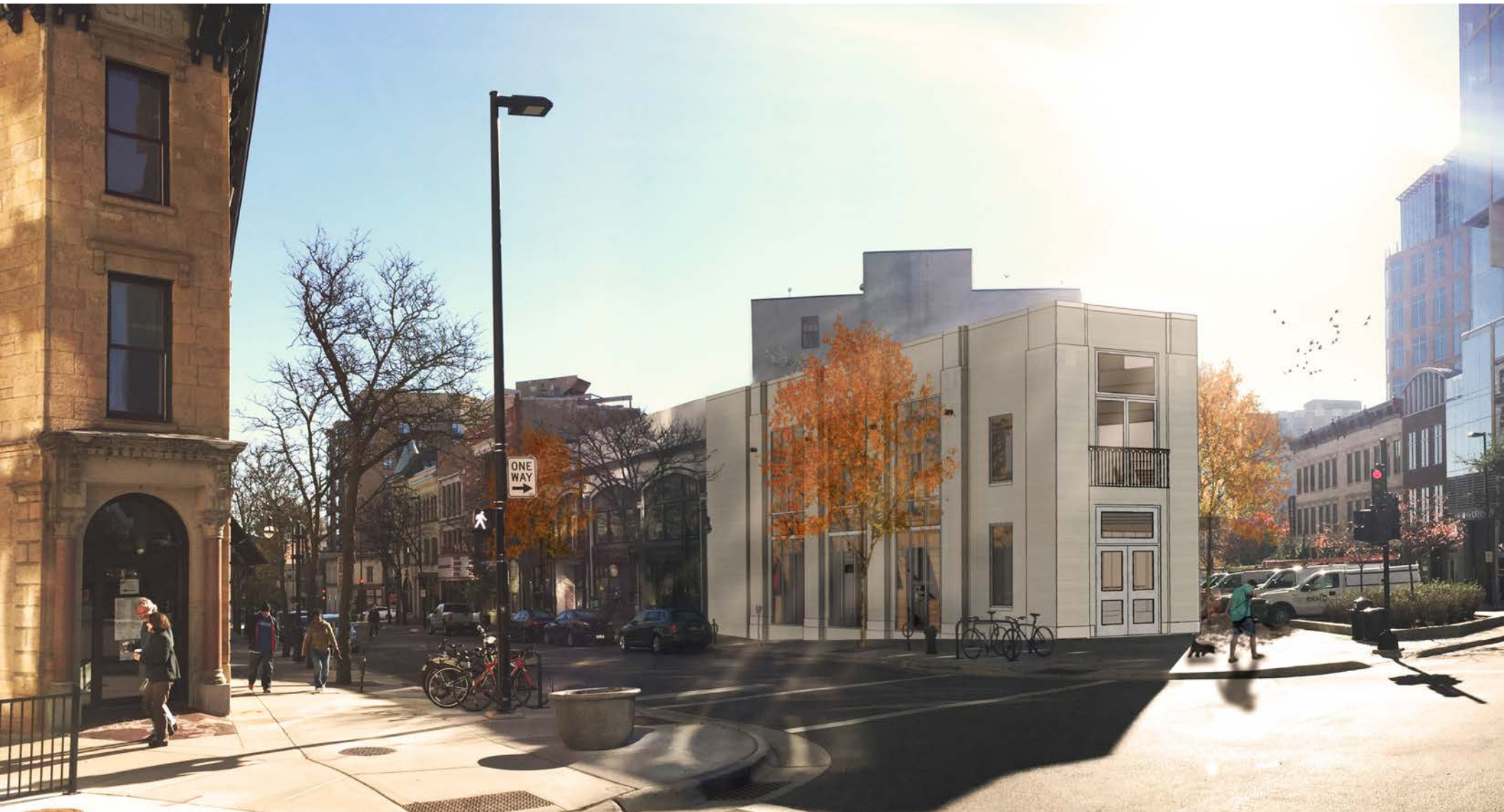
KING STREET CORNER PERSPECTIVE