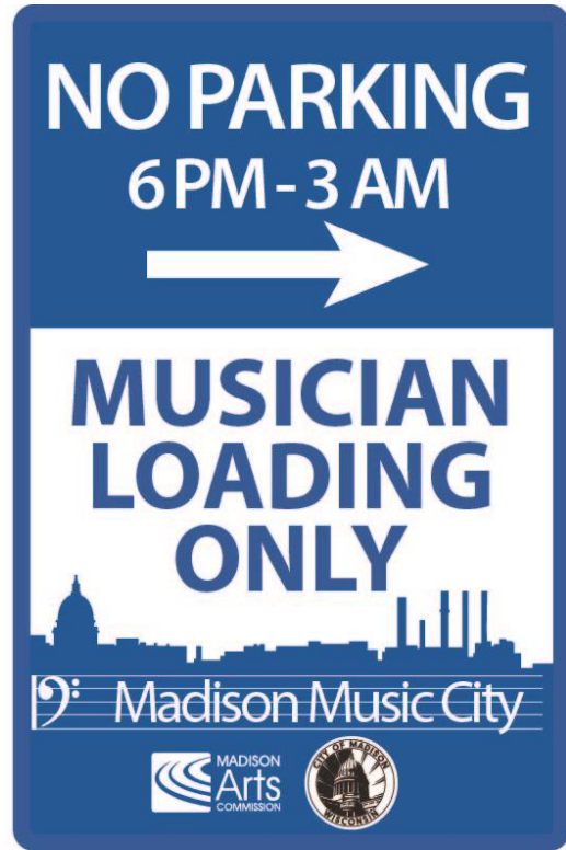
Sign Design Idea (with and Without directional arrow)