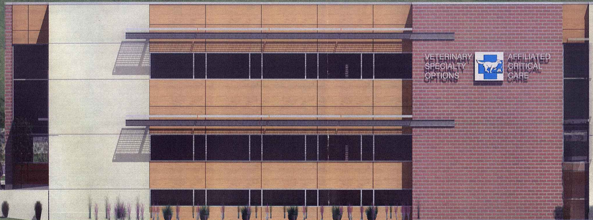
SOUTH ELEVATION SCALE: 1/8"=1'-0"