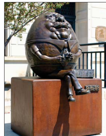
Harry Dumpty Artist: Brent George

Downtown has a shortage of park and open space land. Currently, Downtown has approximately 80 square feet of park land per person 8 compared to approximately 1,100 square feet per person for the city as a whole — fourteen times the amount available for Downtown residents. As densities increase, this shortage will only worsen unless new parks are established. Developing new park land is a very challenging and expensive proposition