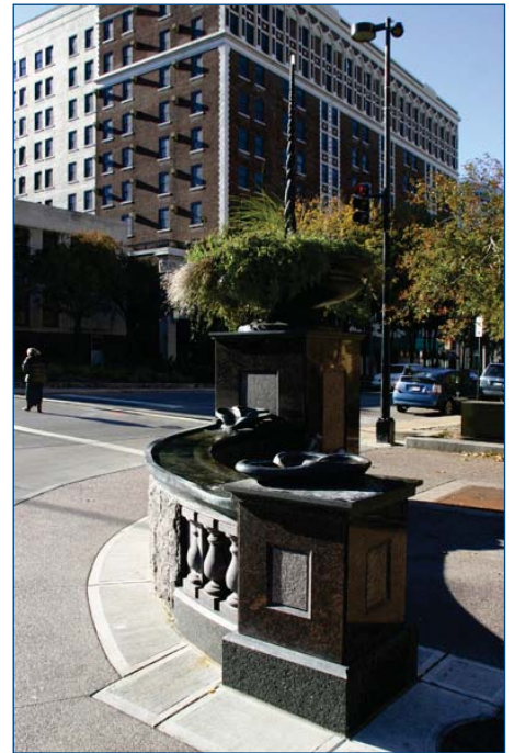
Fountain on Capitol Square

Goodman Pool are another example. This Downtown Plan encourages a wide range of public art, from major features to small, everyday objects and even transitional works that may be installed for a short time then change or be removed. This is all part of keeping Downtown interesting, exciting, and ever changing.