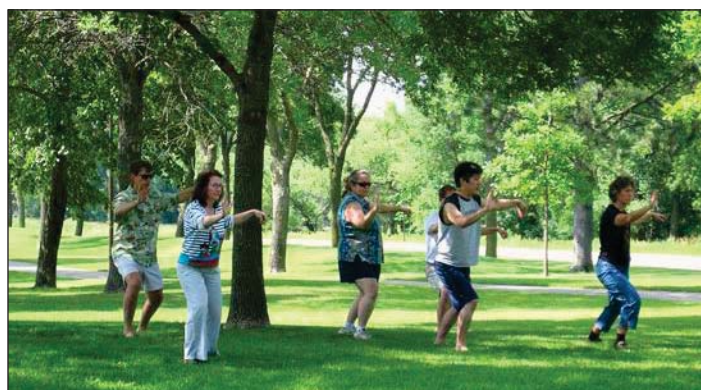
Downtown parks need to accommodate a variety of uses