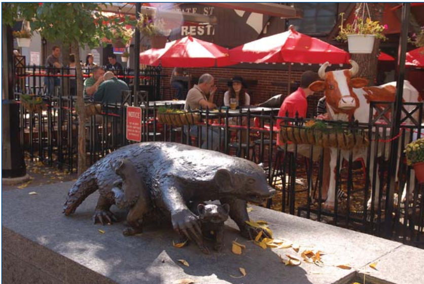
Four Lakes Artists: Myklebust + Sears