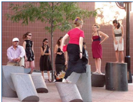
Philosophers’ Grove at the top of State Street. Artist: Jill Sebastian

(5-minute walking distance) from other parks, and the existing and proposed residential densities. Many properties in the immediate area have been redeveloped during the past decade with large buildings that provide little to no open space for residents. The area proposed for the new park is well located to serve the hundreds of student-oriented residential units built in the vicinity, as well as the hundreds of additional units accommodated by this plan. The park is recommended to be approximately 1½ to 2 acres in size.