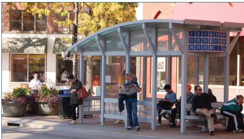
State Street bus shelter