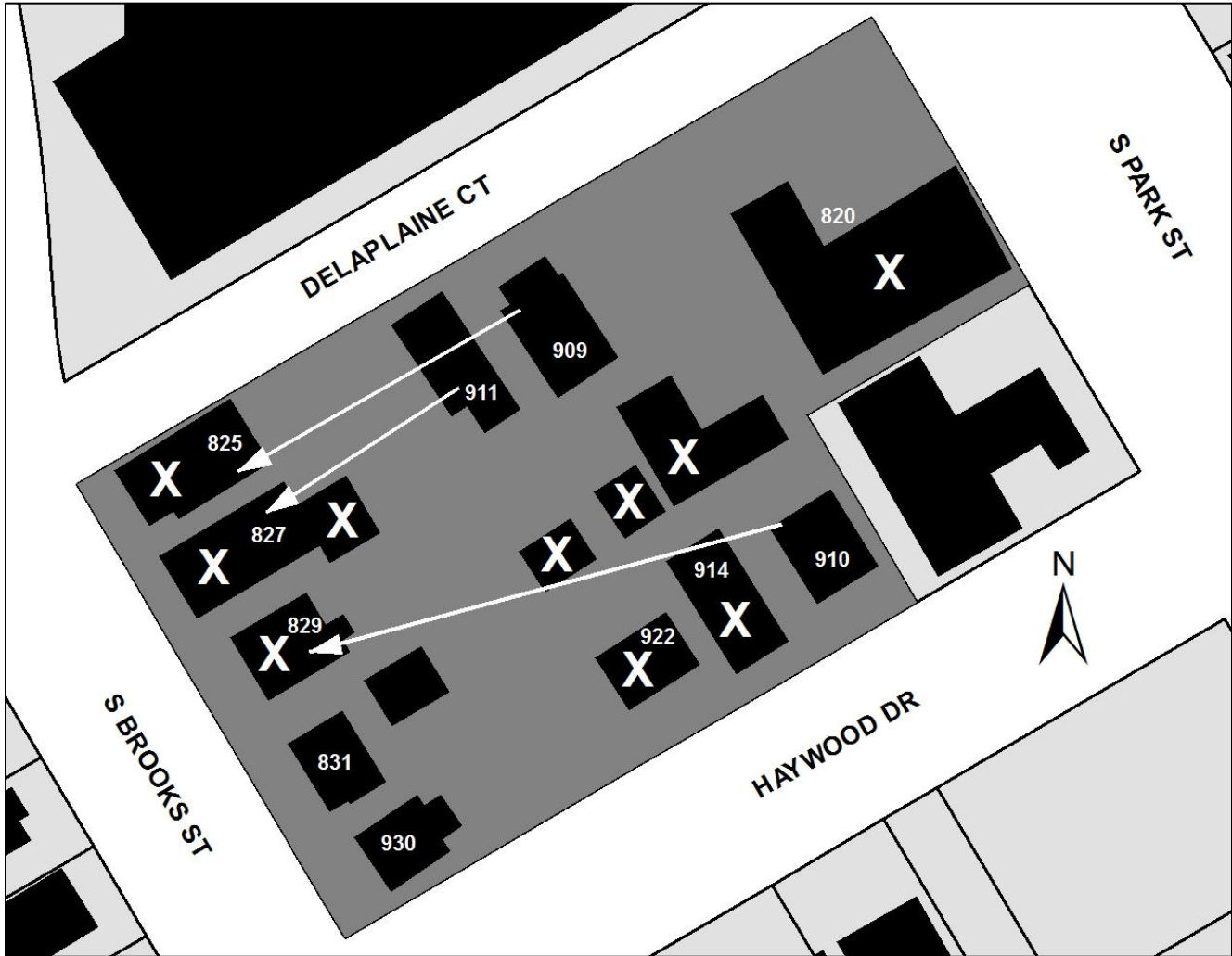
Table 1: Proposals for existing buildings on the subject property