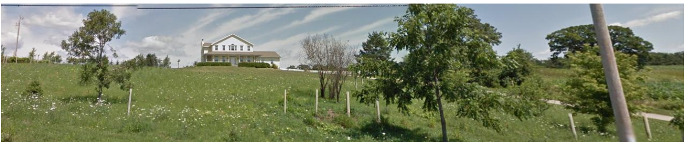
Google street view