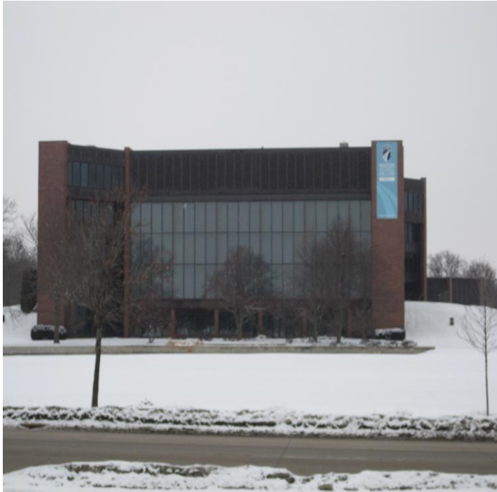
City Assessor's Office

Commercial Building constructed in 1970. Former Madison College West Campus (vacant).