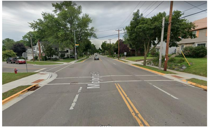
Figure 3: Woodrow Crossing