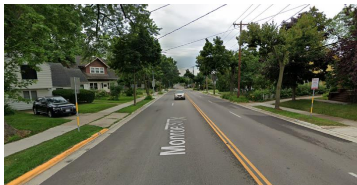
Figure 2: Monroe St Gap Cross Section