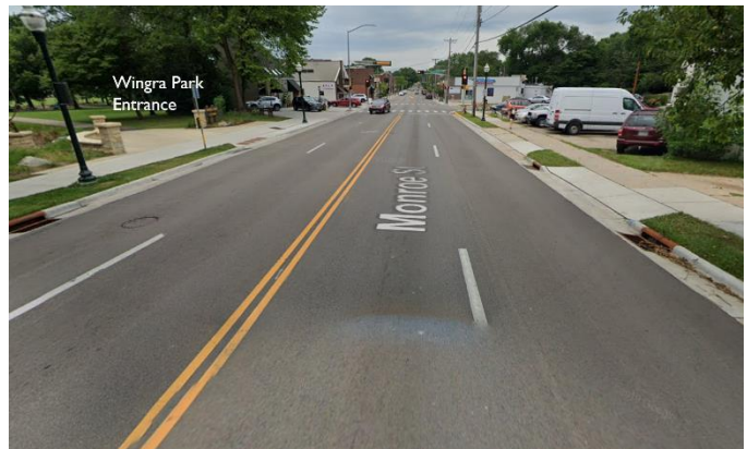
Figure 4: Wingra Park Crossing