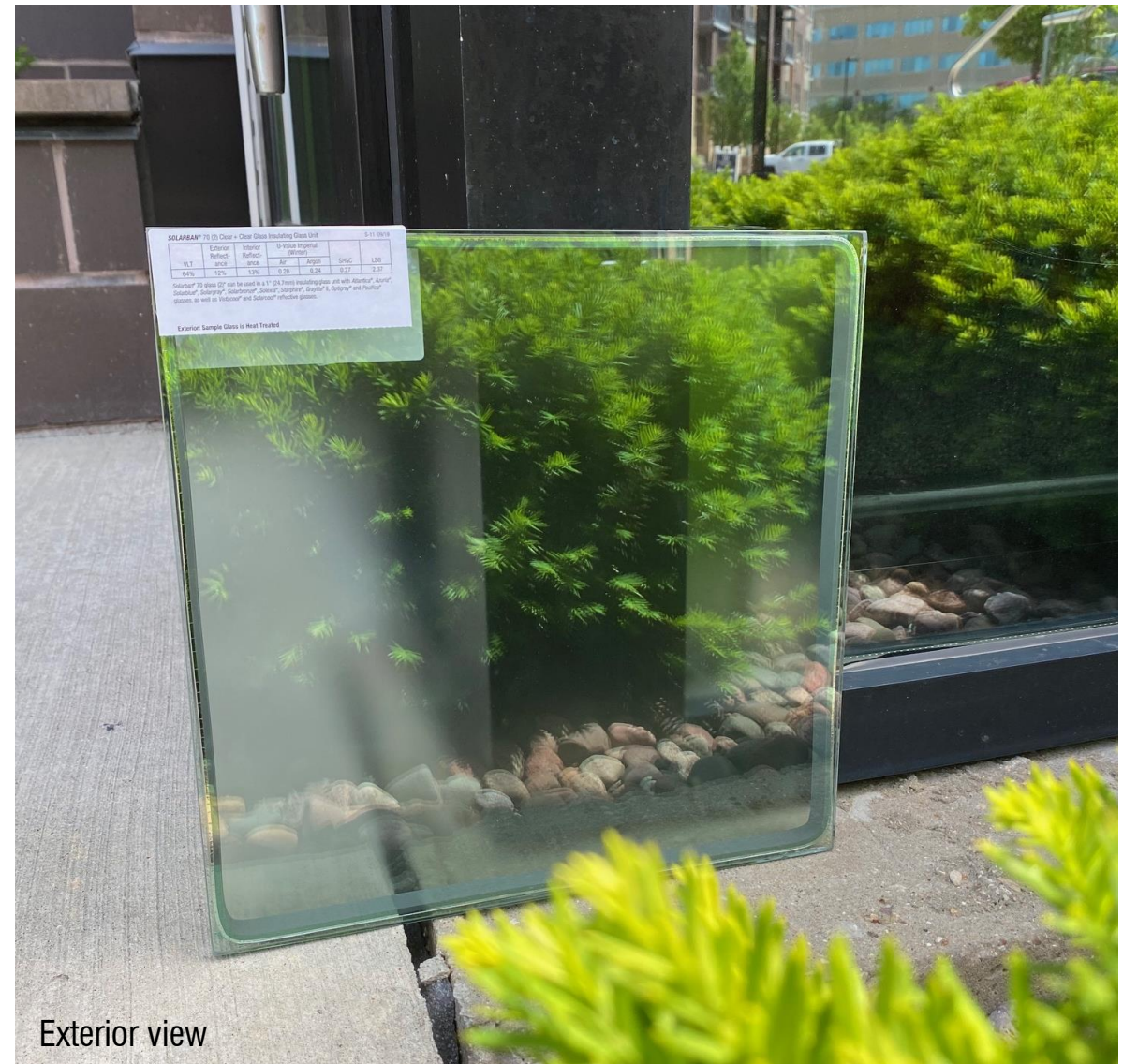
Translucent Glass: Solarban 70 with Satinlite-1 on 3 rd surface