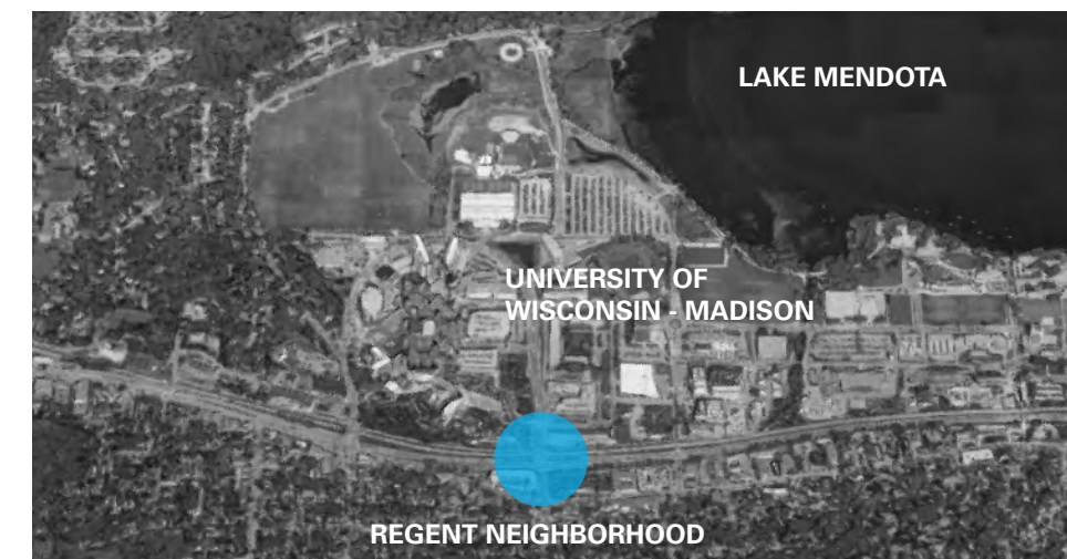
CONTEXT MAP Gateway location between Regent Neighborhood and UW-Madison Campus

Fabrication, lighting consultation and installation will be sourced locally from the Milwaukee-Madison area. Engineering, construction document consultation and electrical services will be provided by the City of Madison. The artist requests use of city storage facilities for panels, frames, and lighting fixtures between fabrication and installation to defray costs.