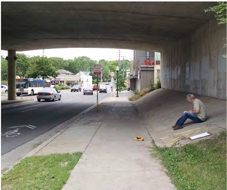
EXISTING CONDITIONS (WEST WALL)