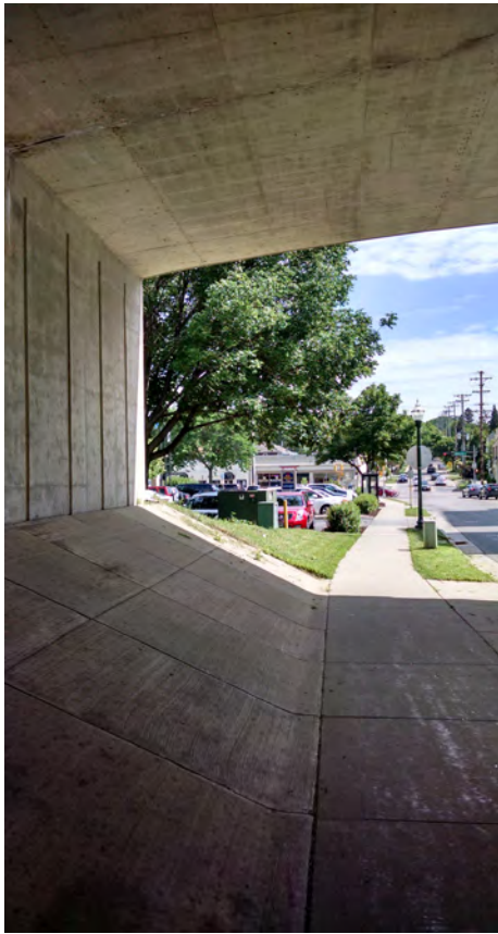
EXISTING CONDITIONS (EAST WALL)