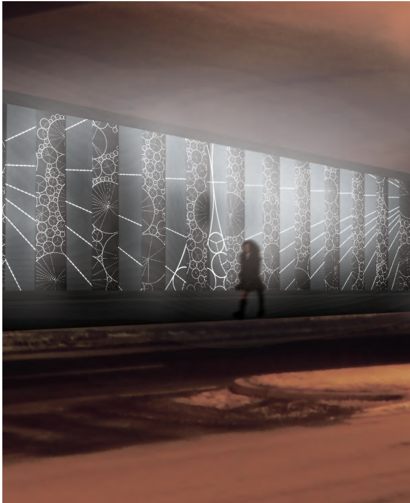
NIGHT RENDERING Artist rendering of proposed LED light sculpture