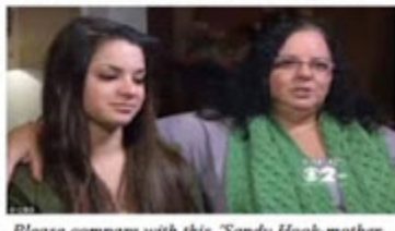
Please compare with this Sandy Hook-mother