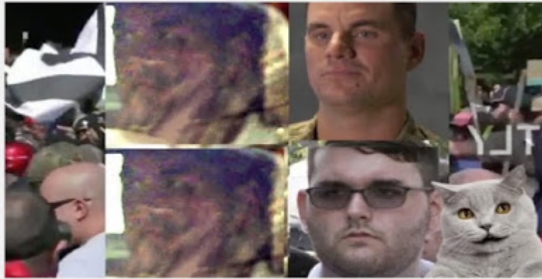
Charlottesville False Flag Theory- Something Strange is going on. [Graphic Content]

Which means that the video journalists who created these studies are more accurate in their reporting about Charlottesville than The New York Times! Anyone aware of the massive assault upon the public's right to publish and share their research--which has assumed unprecedented proportions in scope and frequency to suppress information that exposes deceit and deception by the Deep State--will not be surprised that "Some odd things about the event in Charlottesville" is no longer available (but appears to be still on-line under a different name ) but that "Charlottesville False Flag Theory--Something strange is going on" appears to have completely disappeared.