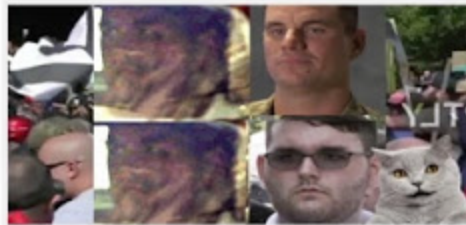
Charlottesville False Flag Theory: Something Strange is going on. (Graphic Content)

Charlottesville False Flag Theory: Something strange is going on https://www.youtube.com/watch?v=f-IL6LXHsO4