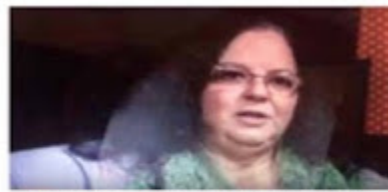
We let the two images overlap each other + change the transparency = A perfect match