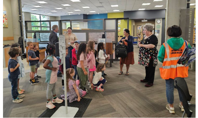
Black Hawk Middle School students at Central Library (left) and Midvale Elementary students at Sequoya Library (right)