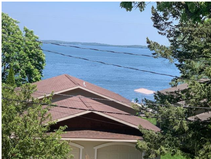
View over 5106 Spring Ct.

Fact: The approval of this remodel will decrease the value of my home significantly while increasing the value of the house across the street. How is this fair? If the city does not regulate this activity, neighbors will start suing each other as there are real monetary damages at stake.