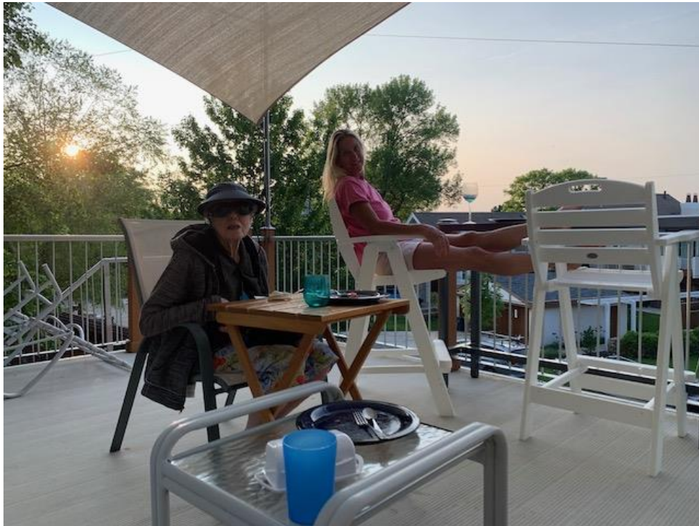
Our favorite Place above the house.