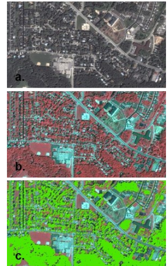
High spatial resolution satellite imagery: a. true color b. false-color c. false-color with urban tree canopy identified in green.