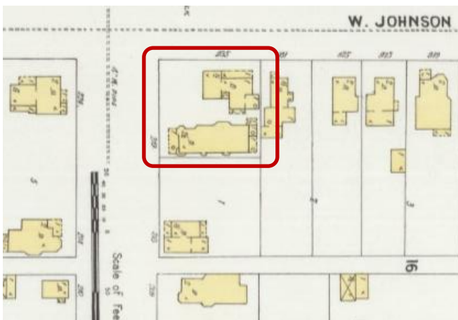
1902 Sanborn Fire Insurance Map