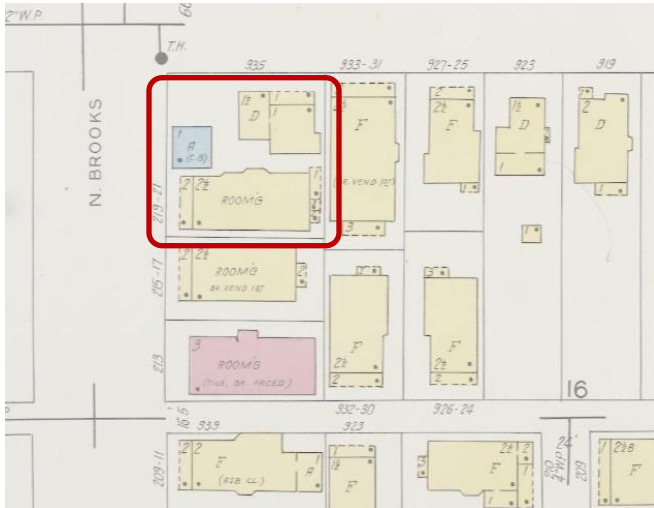
1950 Sanborn Fire Insurance Map