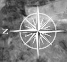
EXHIBIT B EASEMENT DESCRIPTION MAP 20' WIDE EASEMENT - 10' EACH SIDE OF CENTERLINE

BEARINGS REFERENCED TO THE WISCONSIN COUNTY COORDINATE SYSTEM (DANE COUNTY) NAD 83 (2011) 2010 AERIAL PHOTO