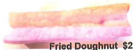
Fried Doughnut $2