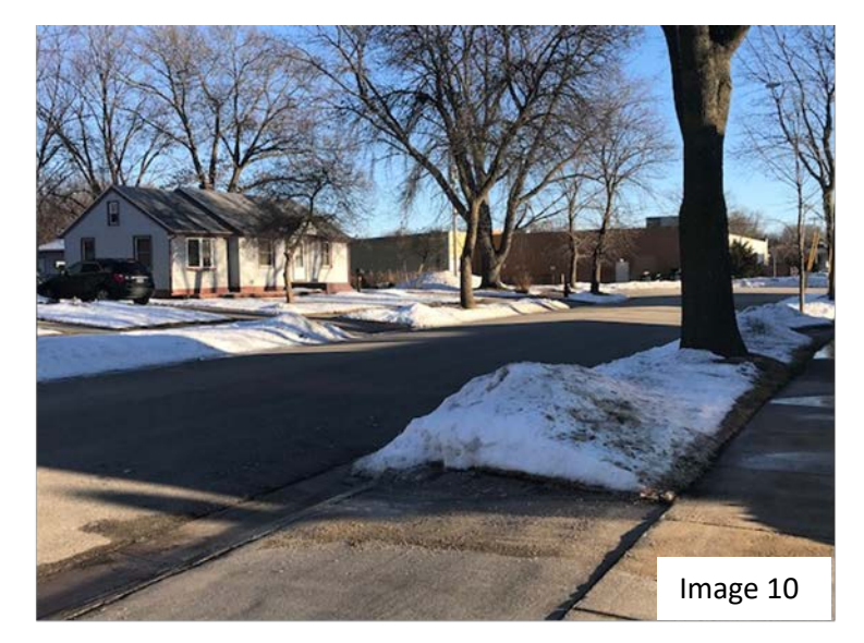
Busse Street facing Pinney Library today, approval of The Grove would mean a view of the 4 story North building.