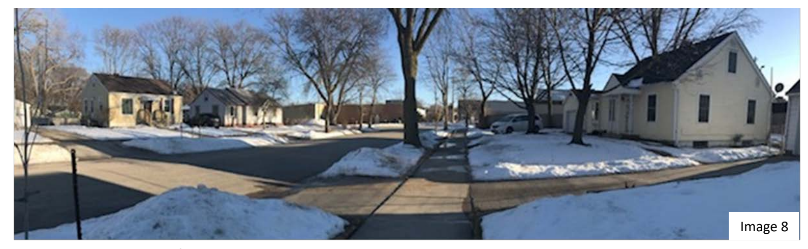
Panorama on Busse Street facing Cottage Grove Road.