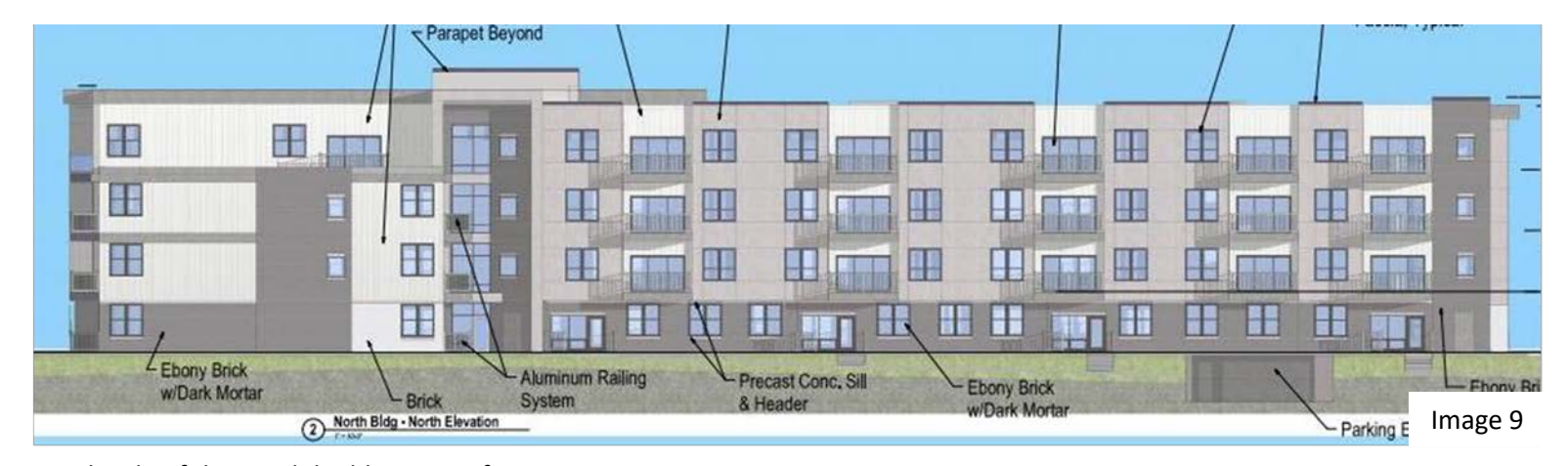
North side of the North building, view from Busse Street. Dimension IV Madison Design Group a2.1