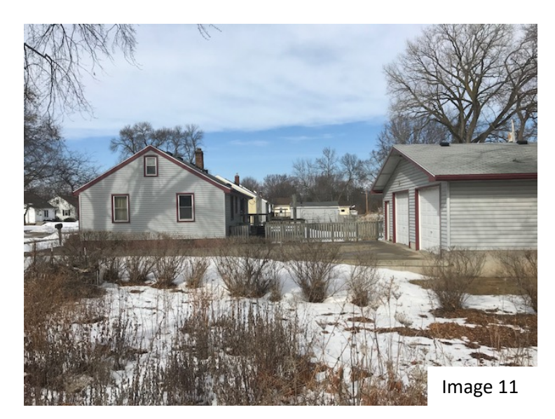
Back yards of homes on the East side of Busse street looking toward Olbrich Avenue that would be viewable by three floors of residents in the North building.