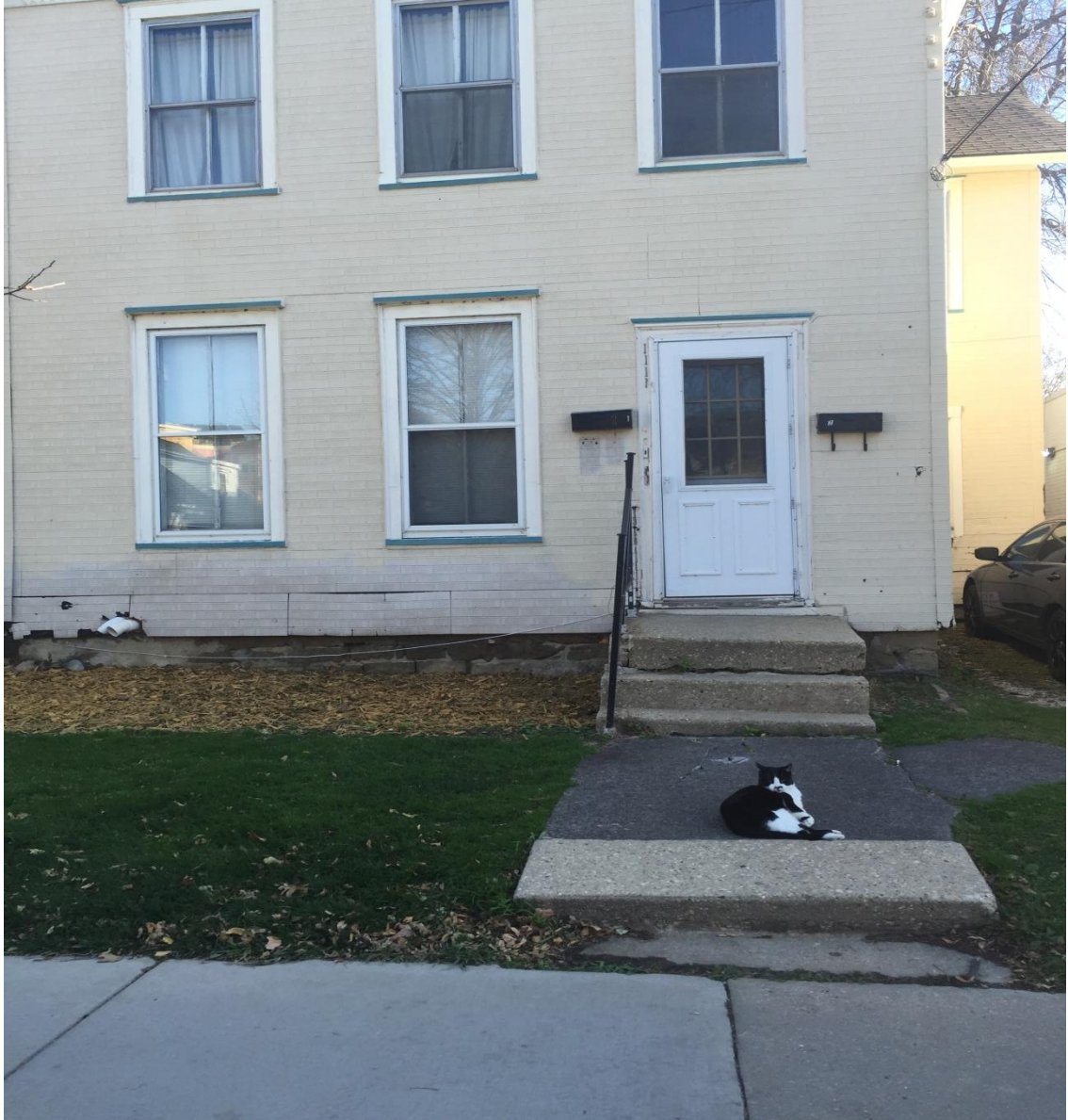
1111 Williamson Before