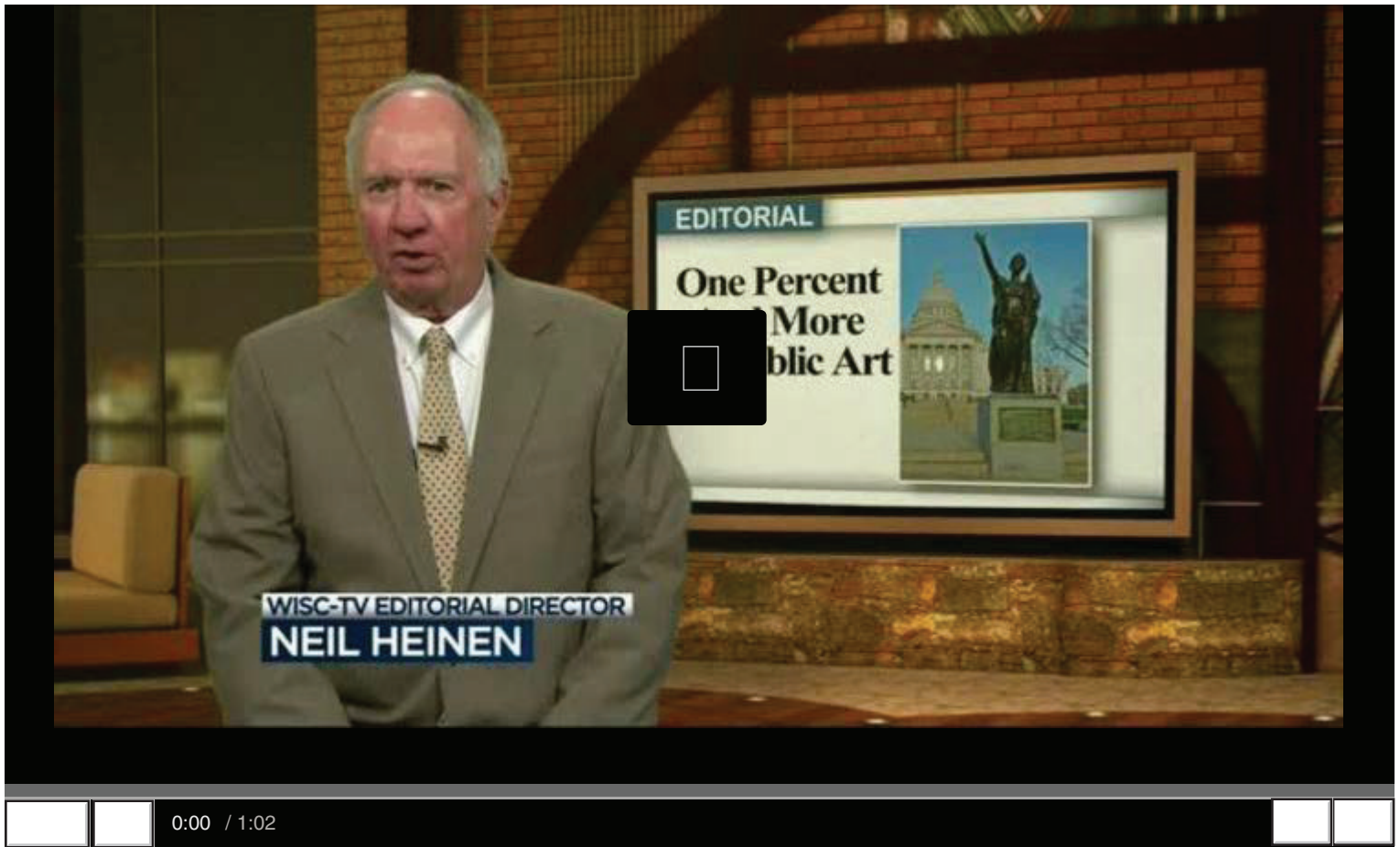
Editorial: One percent and more for...