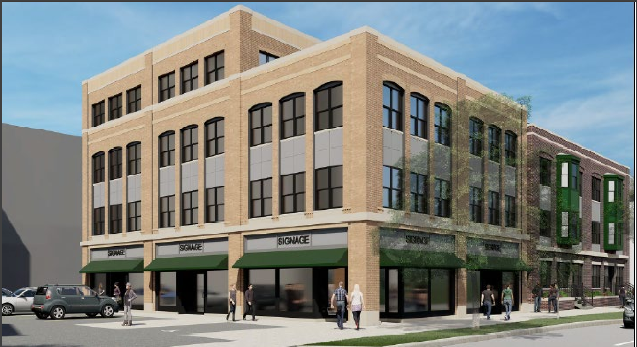
Proposed West Façade Elevation