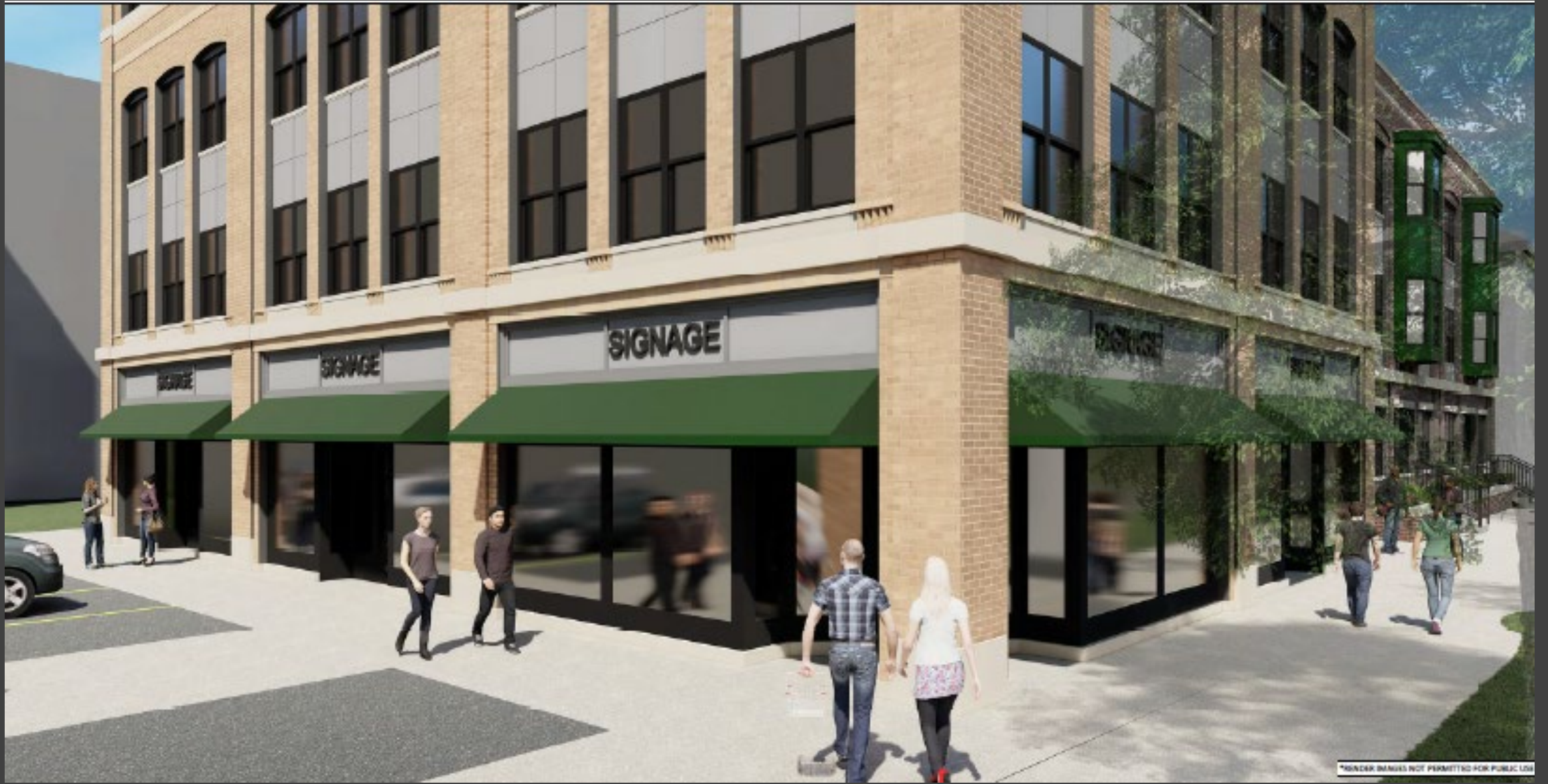
Proposed Commercial Entrances