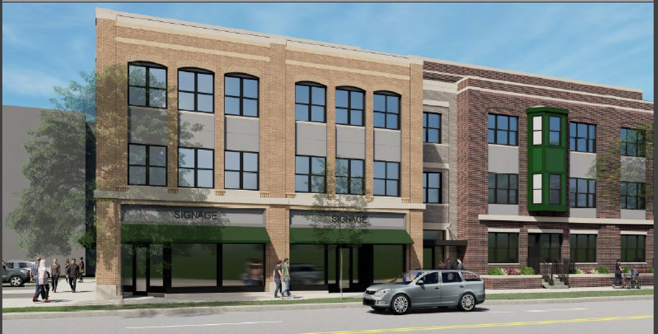
Proposed Williamson Street Elevation