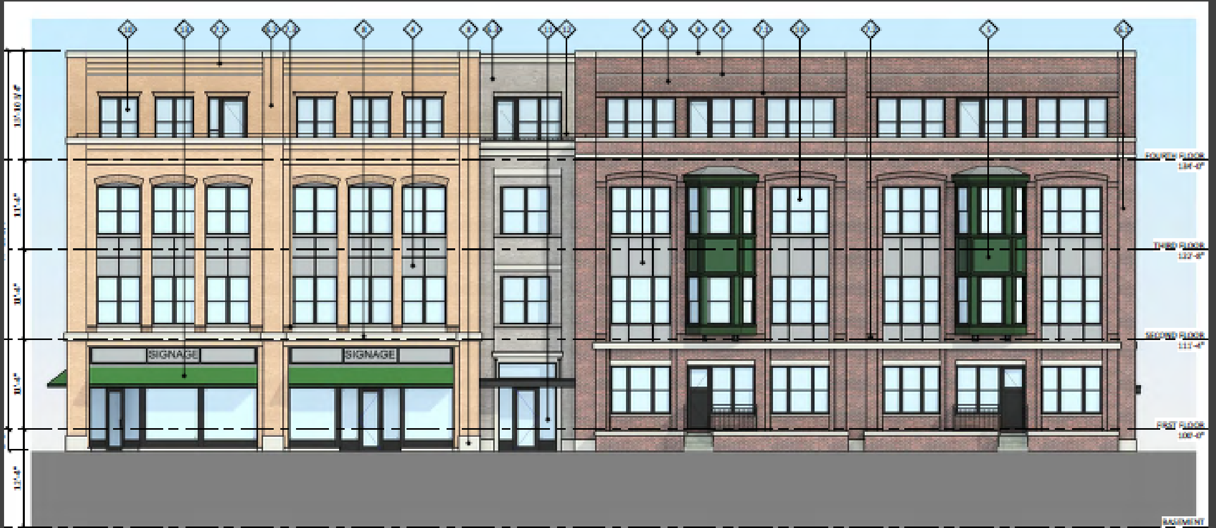
Proposed Williamson Street Elevation