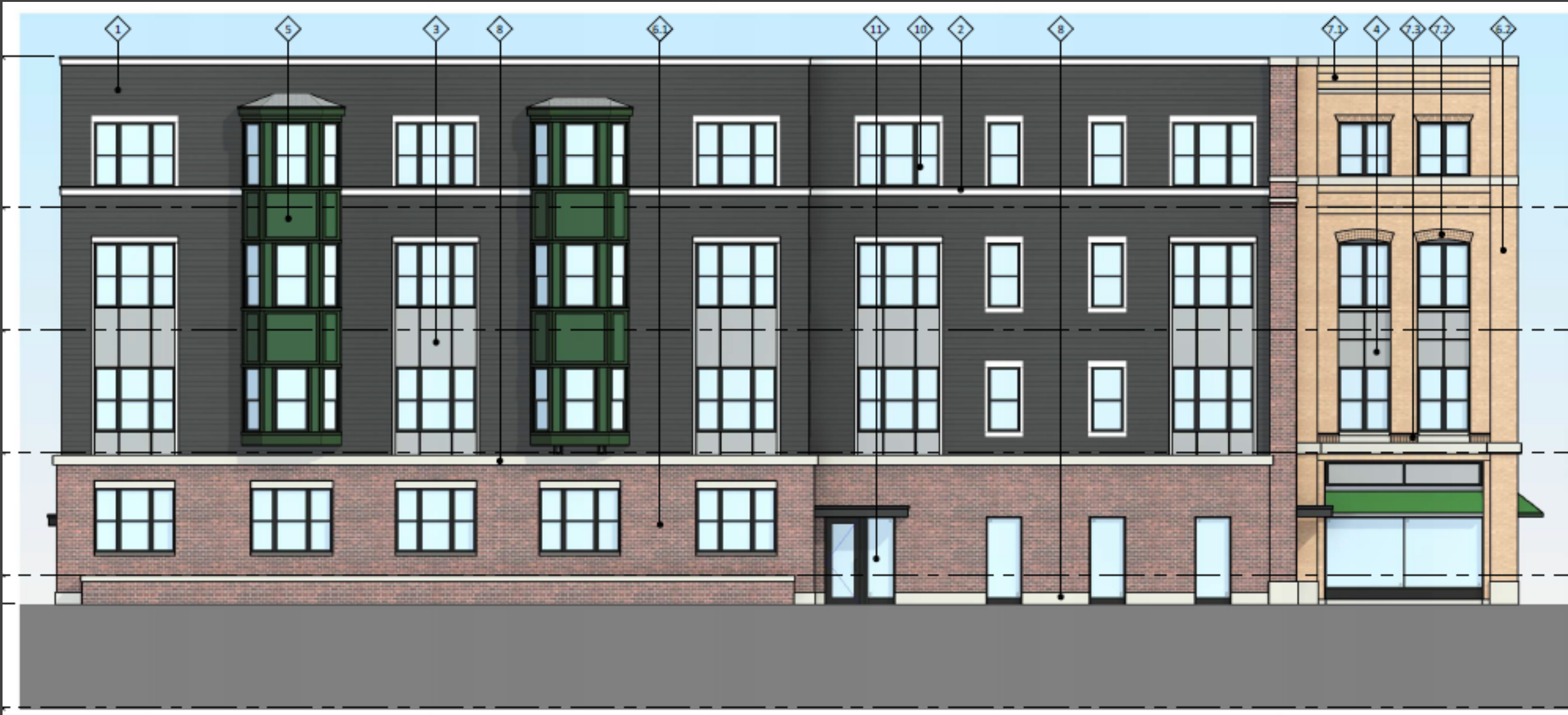
Proposed North Façade Elevation