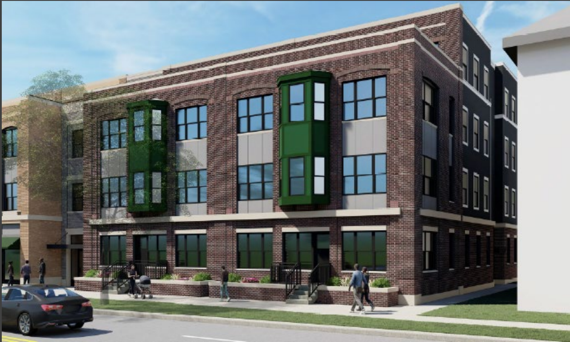
Proposed Williamson Street Elevation