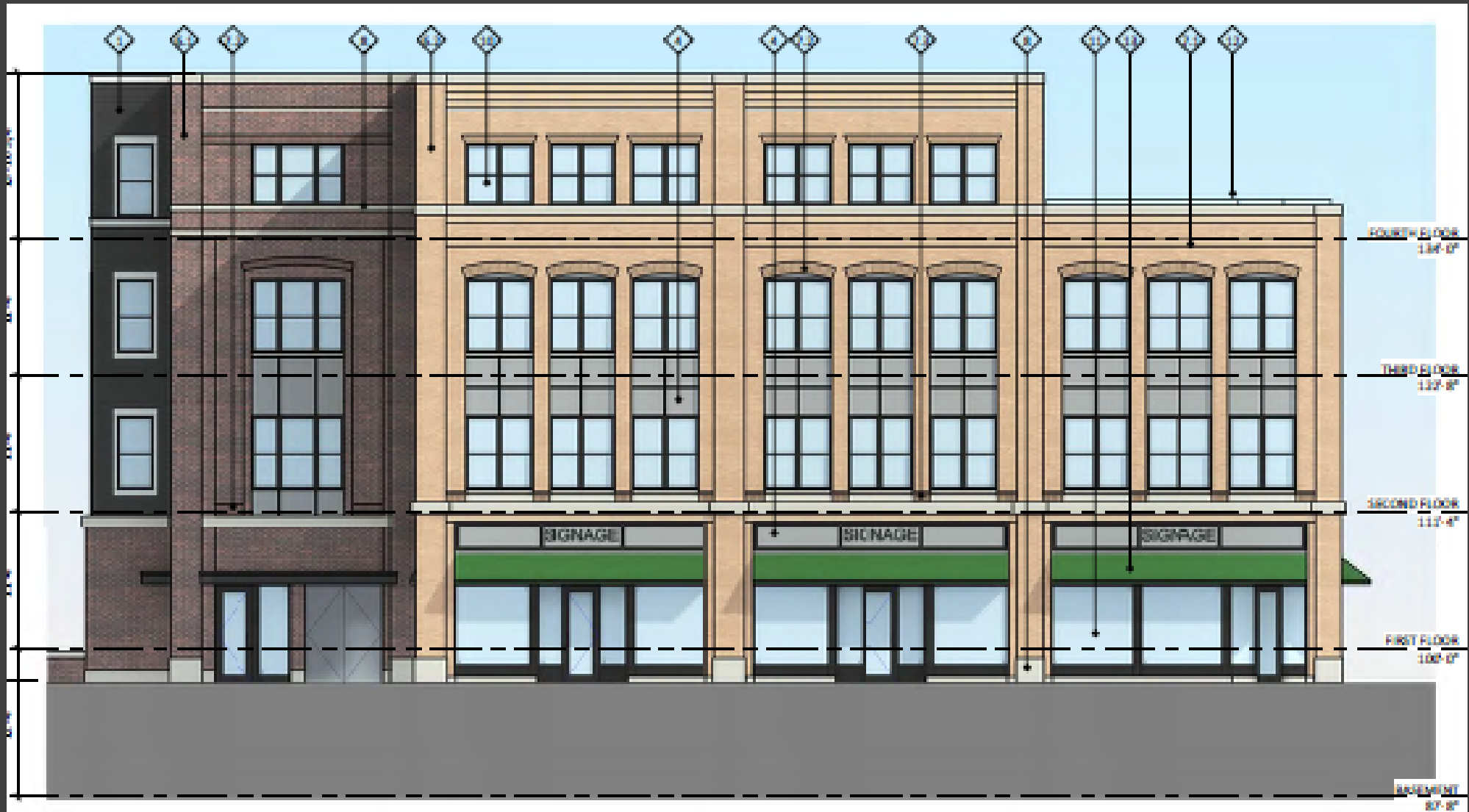
Proposed West Façade Elevation