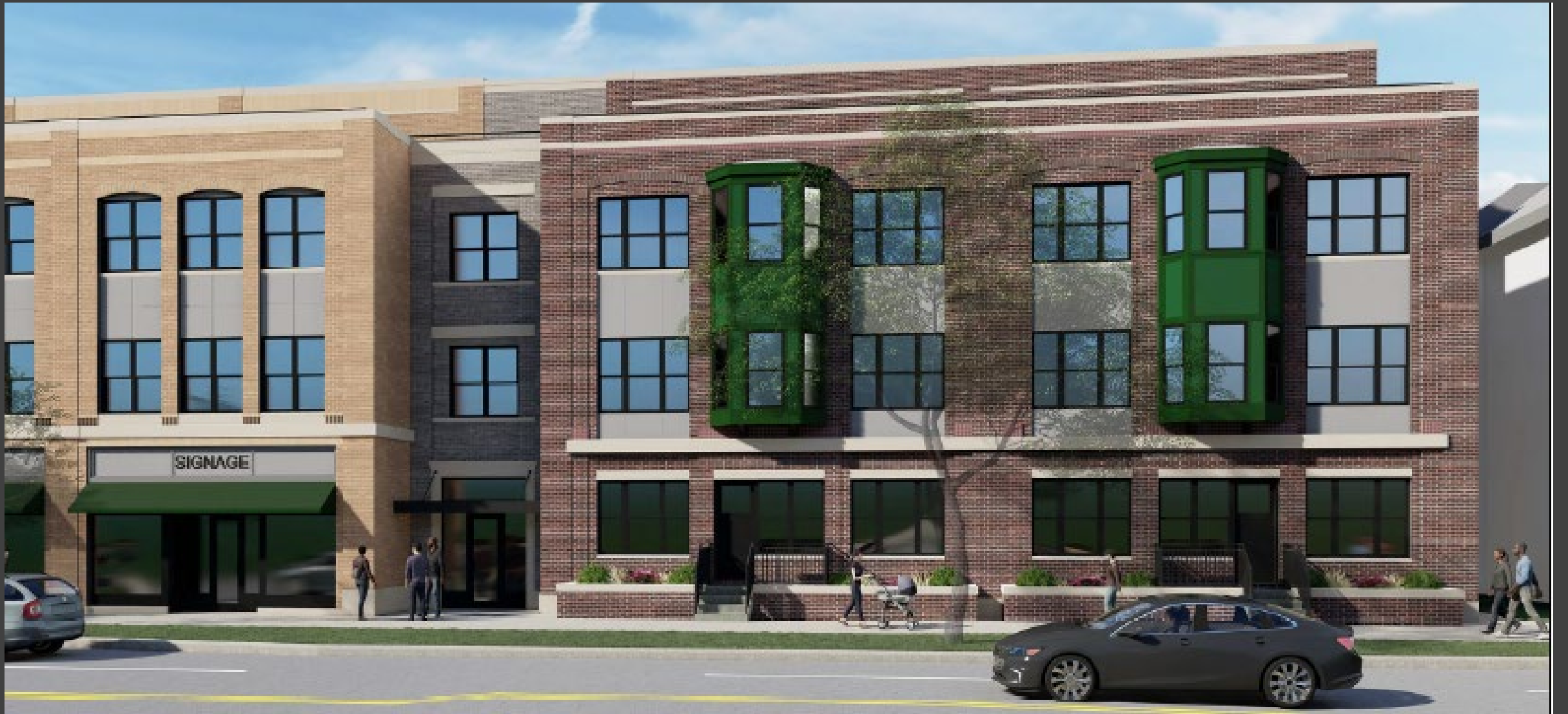
Proposed Williamson Street Elevation