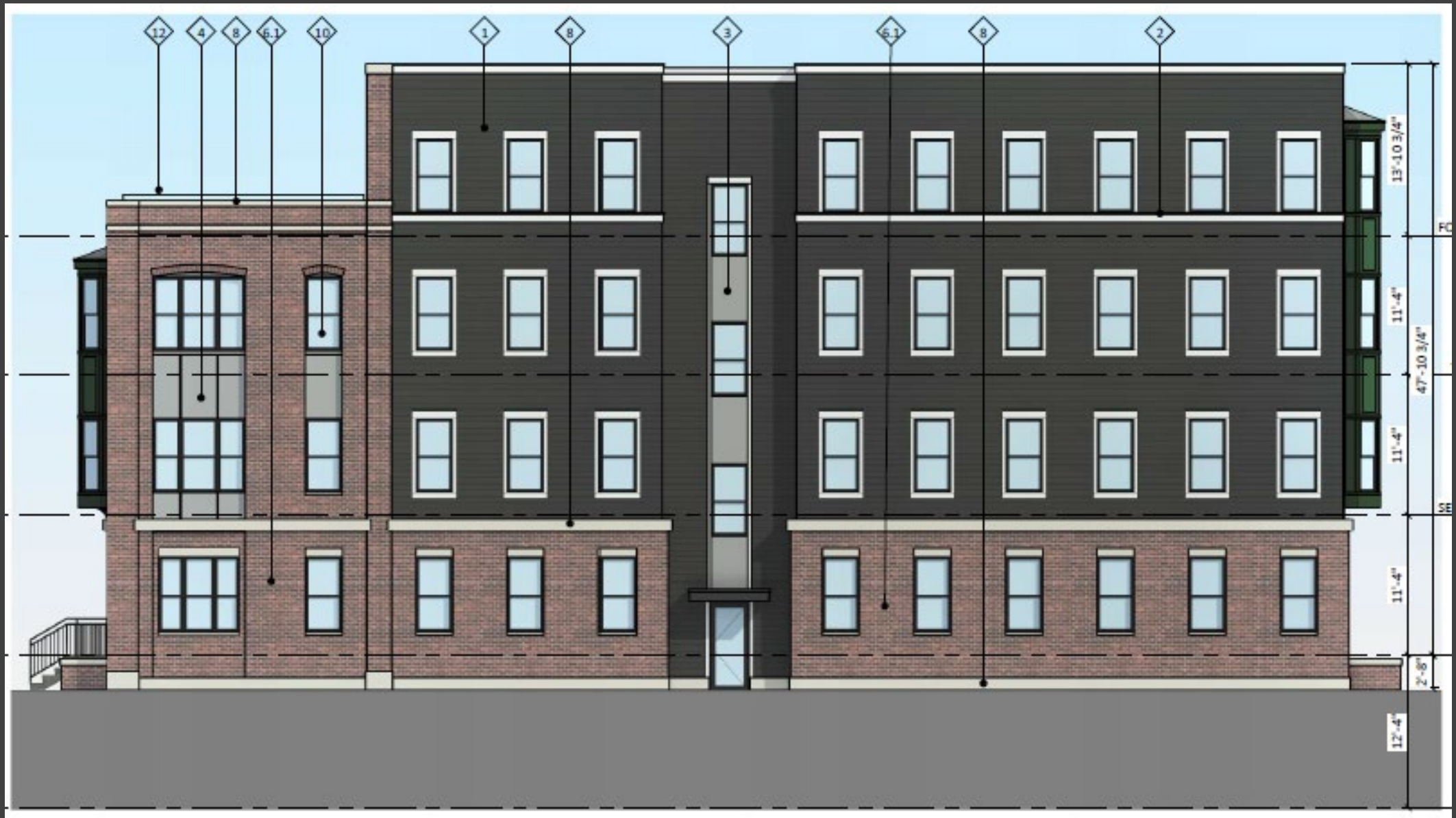
Proposed East Façade Elevation