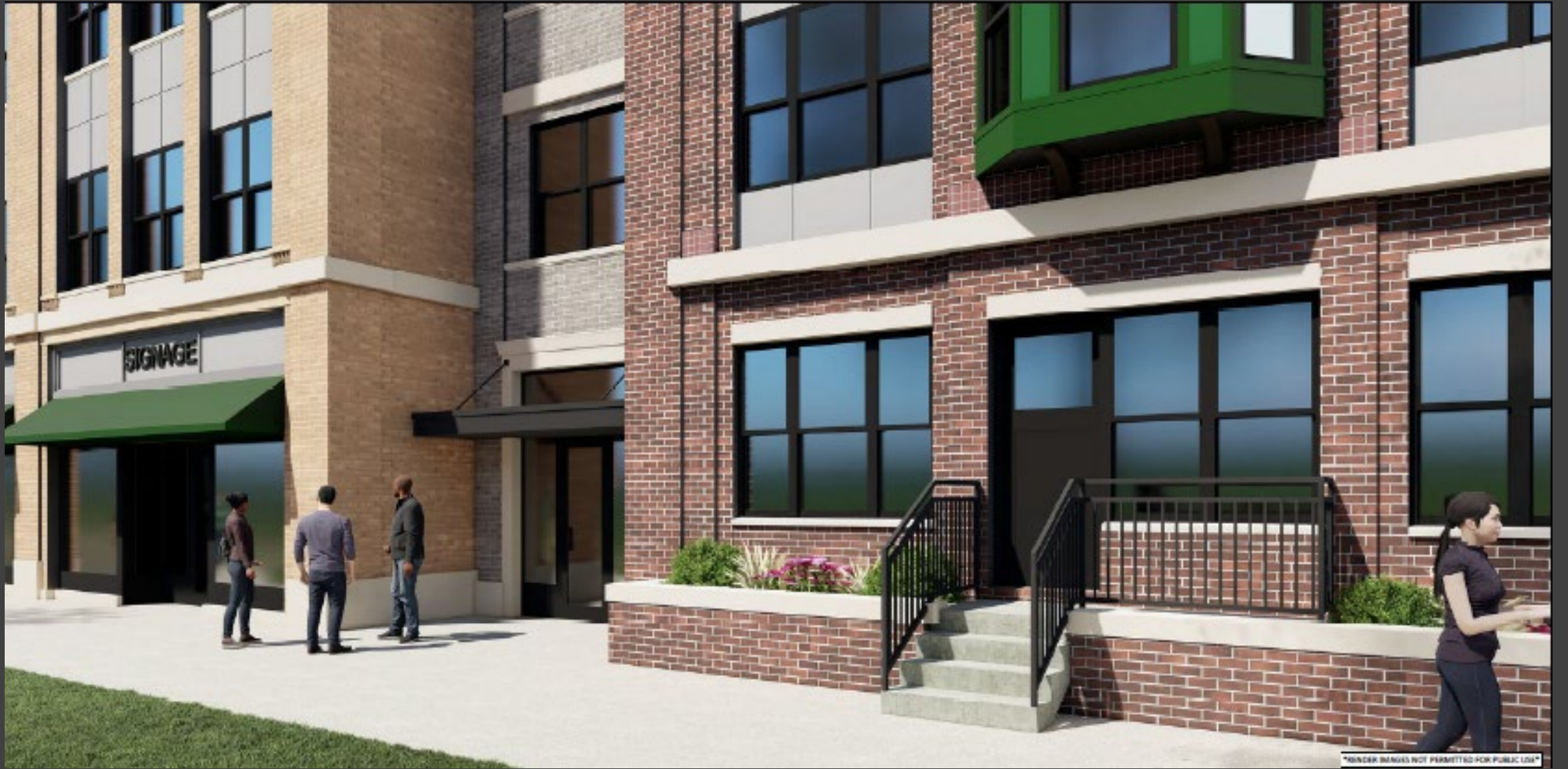
Proposed Residential Entrances