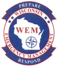
EXHIBIT C Wisconsin Hazardous Materials Response System