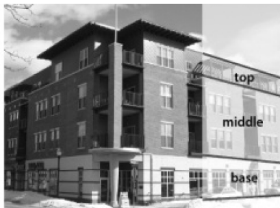
Figure D7: Building Articulation