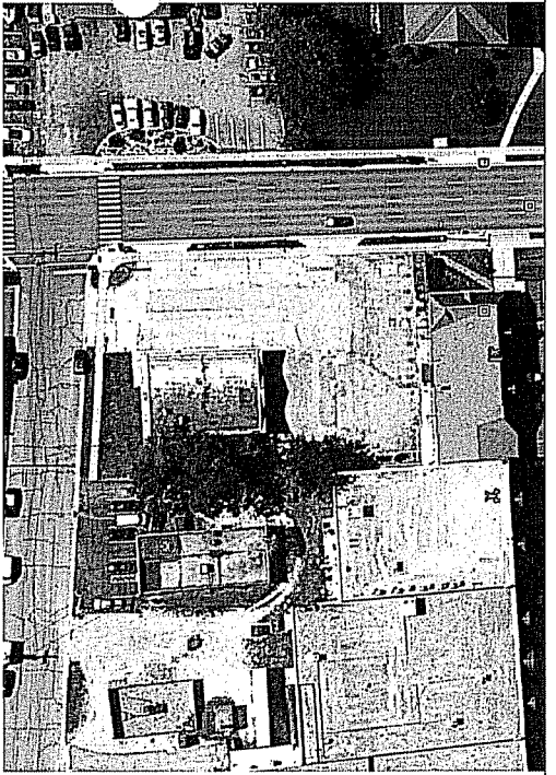
3 AERIAL PHOTO 1 1/2" = 1'-0"