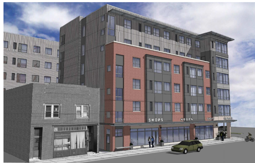
REGENT STREET PERSPECTIVE