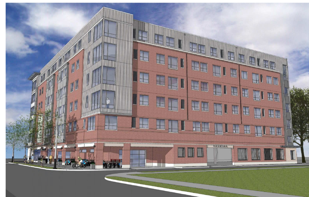
PARK AND COLLEGE CORNER