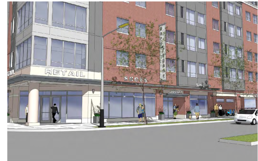
PARK STREET STOREFRONT