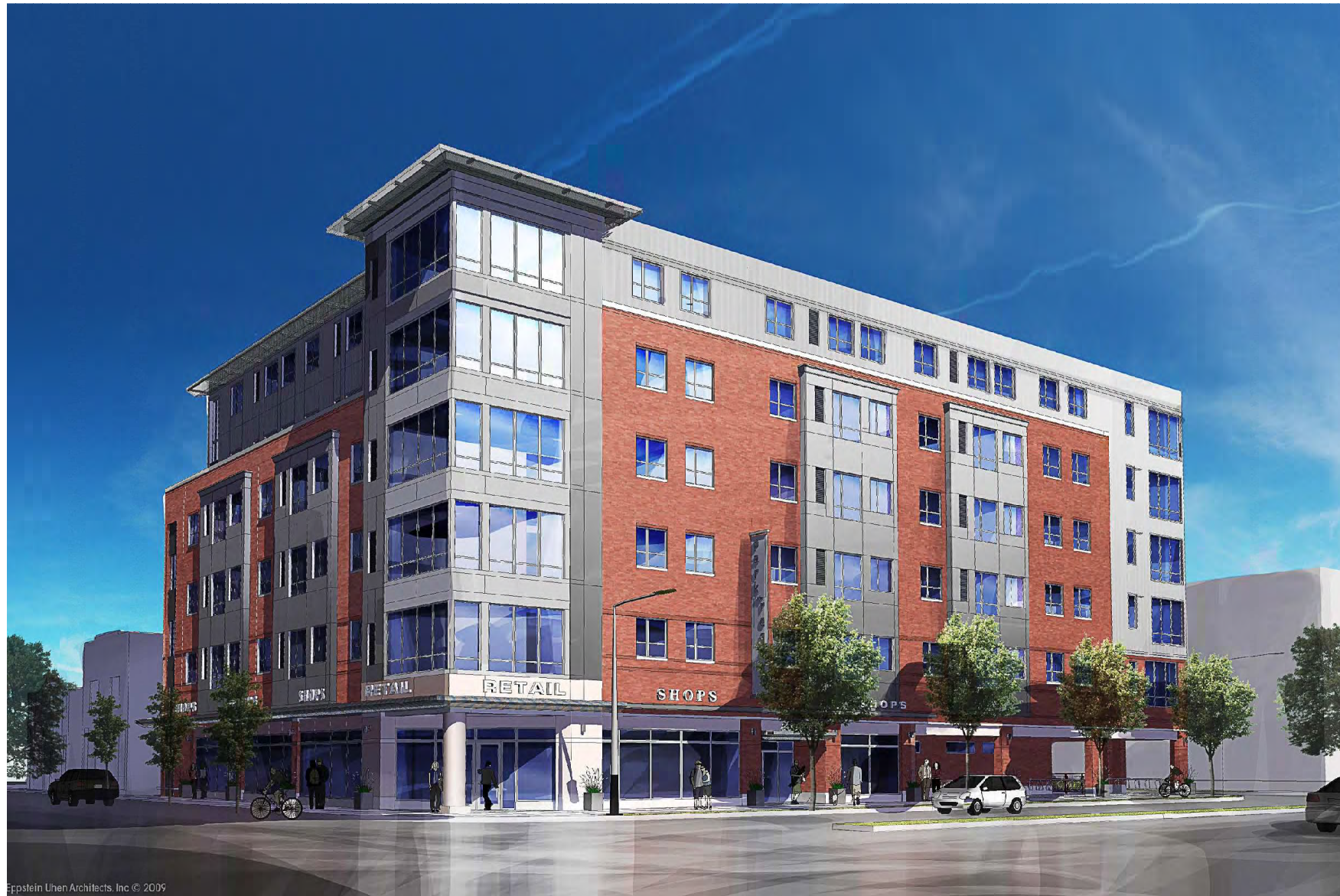
REGENT AND PARK CORNER