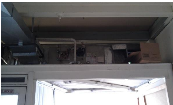
Furnace above entrance

The heating system consists of an atmospheric hot water boiler that serves the upper floors. The first floor is heated from a gas-fired furnace located above the first floor front entrance. A functional domestic water heater exists in the boiler room. The roof is pitched from the front to the back and drains off the back edge to the alley below. While there are no roof drains, there is a horizontal cast iron storm pipe that runs the length of the basement. This pipe originates from a cistern in the alley that receives storm water from adjacent building downspouts (to the east of building 117-119 State) through corrugated tubing. It appears that the stormwater from the 117-119 State Street building also discharges into this cistern through an underground lateral. From the cistern, it is piped through the basement of this building and into a storm main in West Mifflin St. The sanitary piping is entirely cast iron, most all of it original. Water piping from the basement to the second floor appears to be lead.