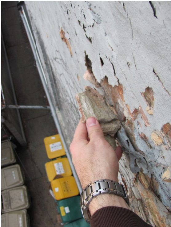
Figure 7. Left. Loose fragments of brick/mortar/parging were removed by hand from the side wall.