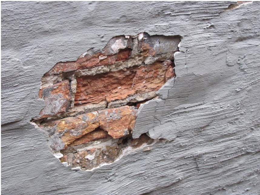
Figure 5. Failure of cementitious parge coat, revealing deteriorated brick masonry.