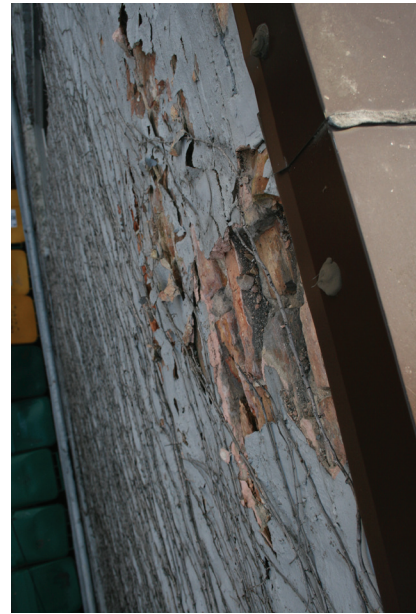
View from roof looking at condition of brick and parged wall