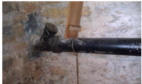
Storm main support/pitch