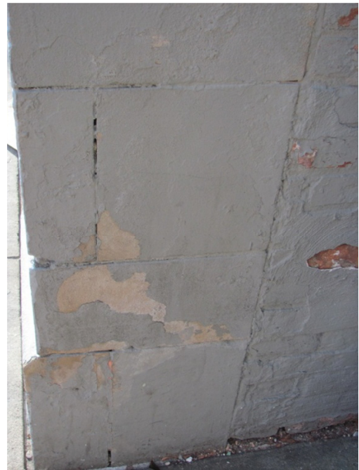
Figure 3. Right. At the limestone masonry of the first floor, some areas of coating have debonded.