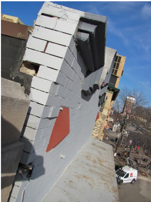
Figure 2. Left. View of displaced masonry at the top corner of the parapet wall.