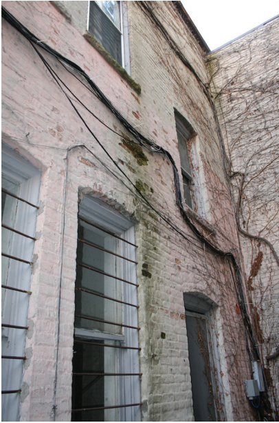
Exterior: View of the back of building showing eroding brick veneer