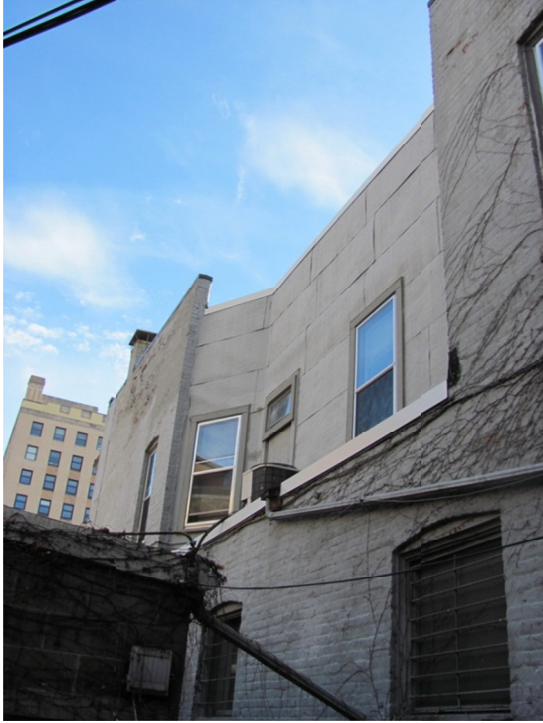
Figure 9. A portion of the side wall is recessed at the second floor and is clad with painted sheet metal.