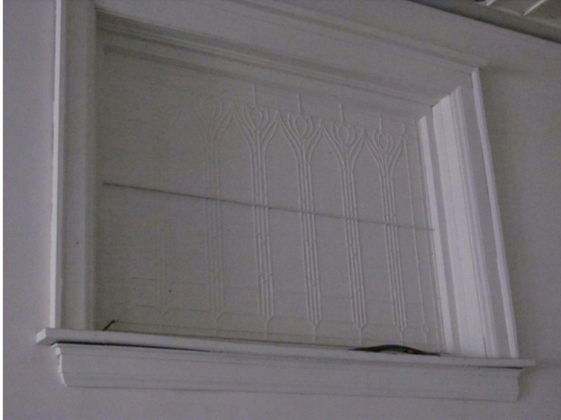
Figure 17. Leaded glass window, which has been painted over, at the southwest party wall.