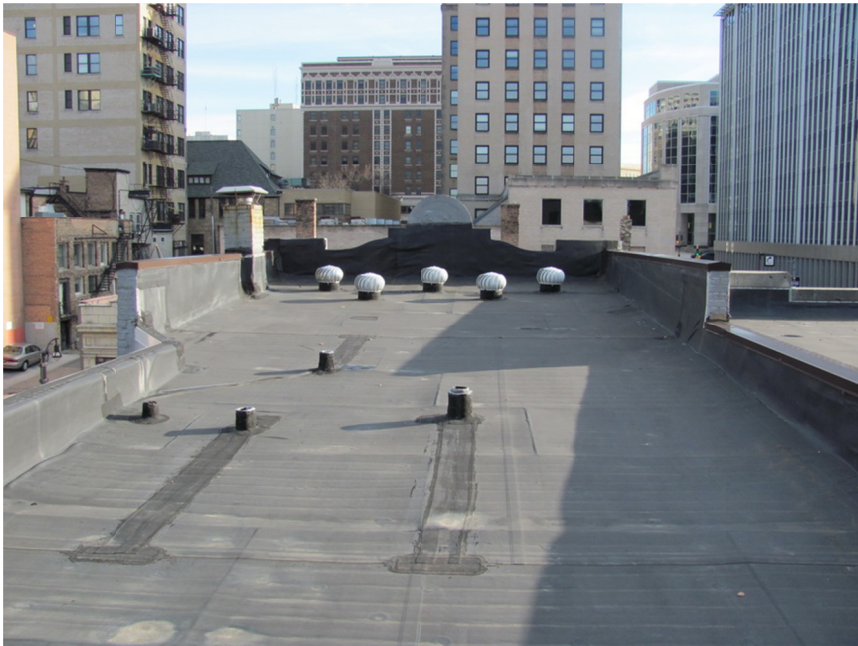
Figure 10. Overview of the roof.