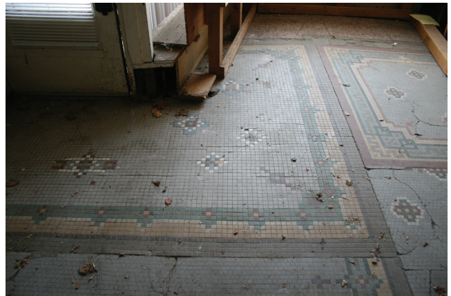
First Floor: View at entry off Mifflin Street showing three flooring surfaces. 1) Original 3/4" square tiles 2) 1" square tiles at entry 3) composite flooring at window