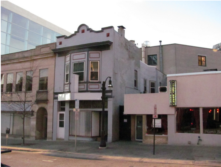
Figure 1. Overview of the building from the south. The Mifflin Street facade is at left.