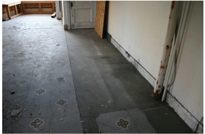
First floor: View of area where exposed concrete is installed