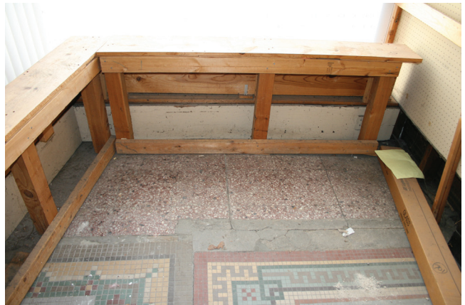
First Floor: View at bay window showing multiple types of flooring