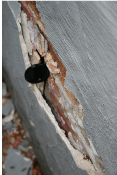
Exterior: View in the alley showing the delamination of the parging system from the brick veneer