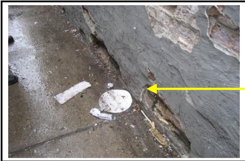
Figure 4 – Spalling brick face-east exterior wall.