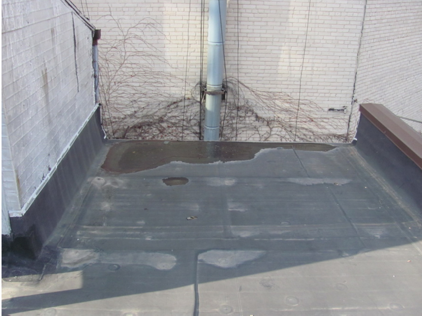
Figure 11. Ponding on the roof near the gutter.