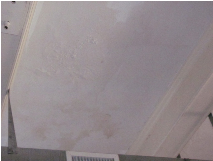
Figure 16. Water staining and bubbling of interior plaster ceiling.