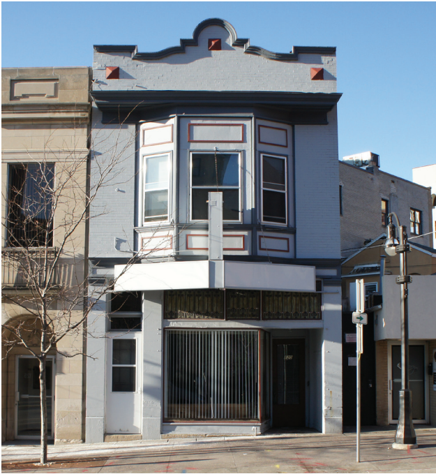
View of the Front Facade