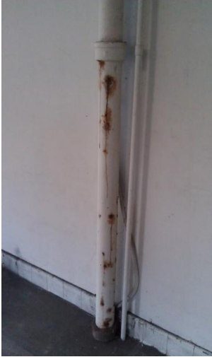
Leaking sanitary pipe