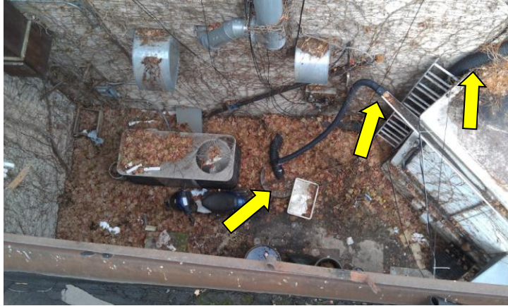
Roof drains into cistern that discharges through basement