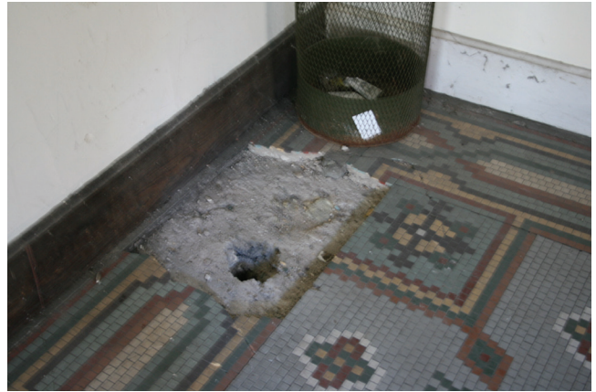
First Floor: View at back of room where the floor has been removed