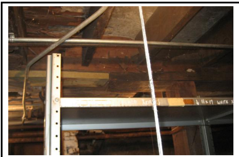
Figure 3 – Wood materials added to aid in support of the joists and the center beam line.