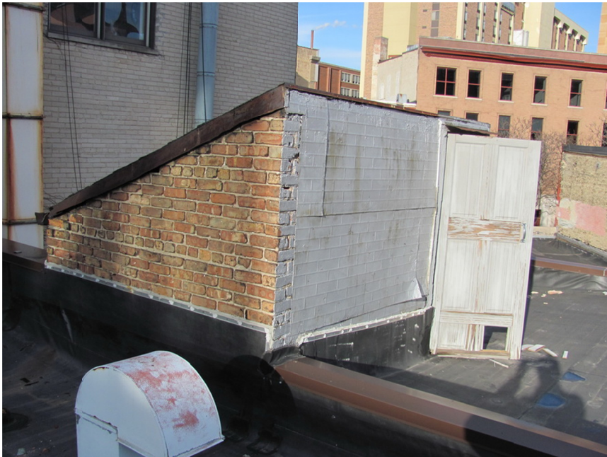
Figure 12. View of the penthouse walls constructed of brick masonry and painted sheet metal.