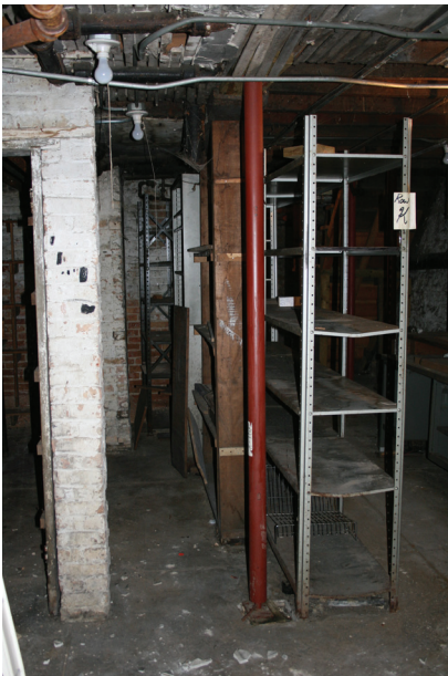
Basement: View of one temporary column supporting the first floor