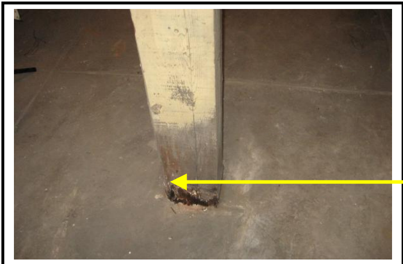
Figure 2 – Rooted column base in basement.