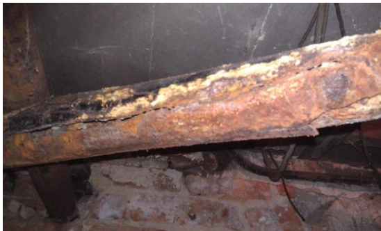
Deteriorated sanitary pipe