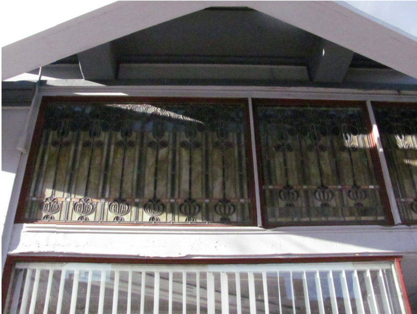
Figure 4. The first floor storefront includes a three-part leaded art glass transom.