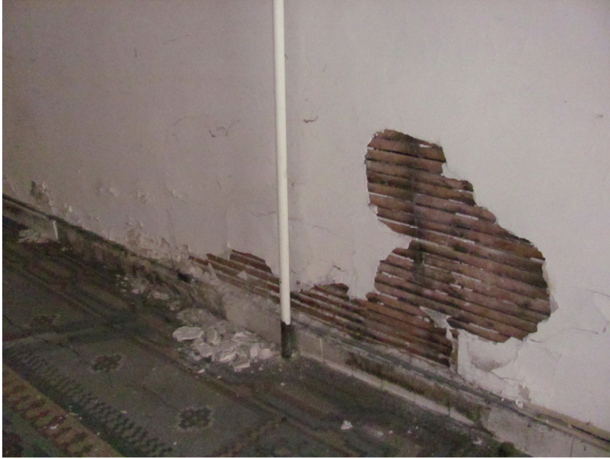
Figure 15. Damage to interior plaster wall finish.