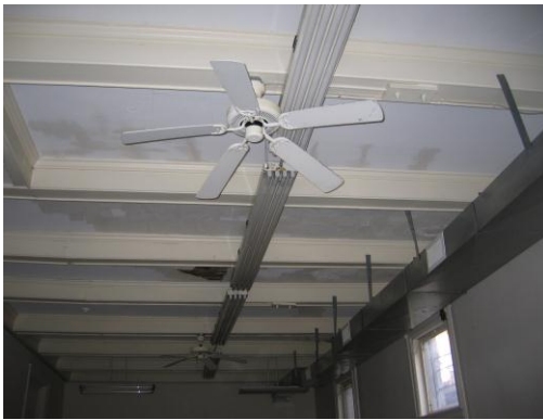
First floor lights.