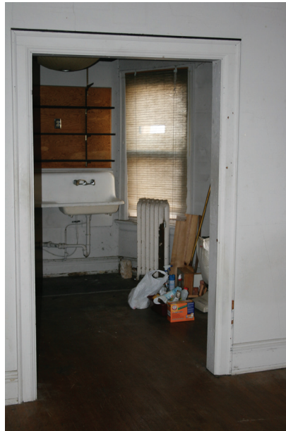
Second Floor Apartment