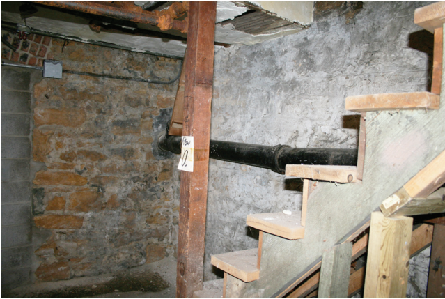
Basement: stormline routing to West Mifflin Street