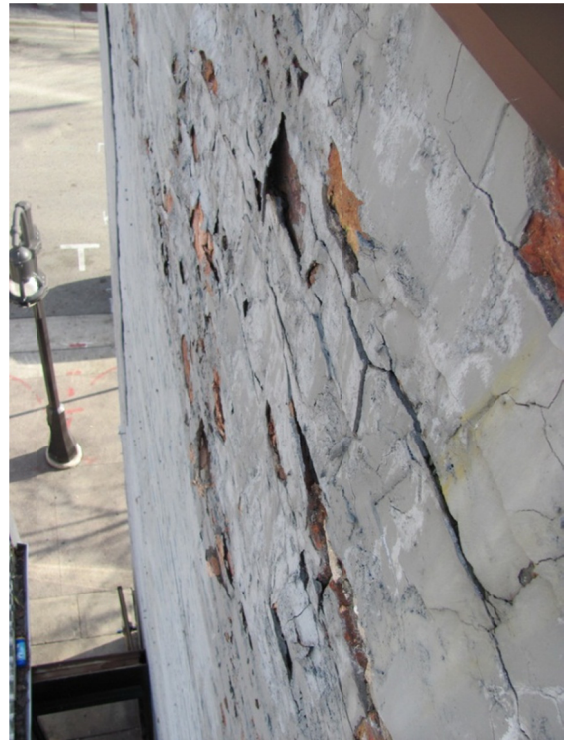
Figure 8. Right. Deterioration of brick and parging near the top of the side wall.