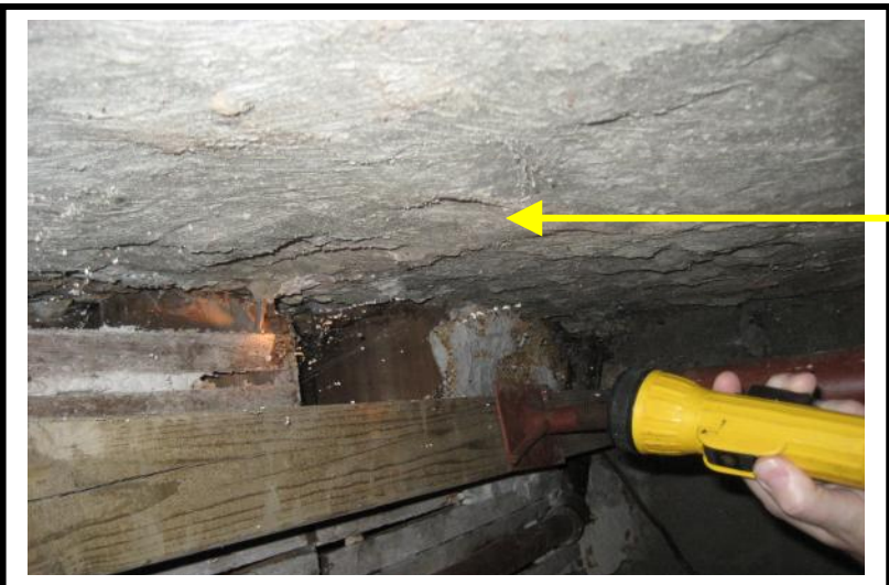
Figure 5 – Picture of rotted end of wood floor joist at first floor.