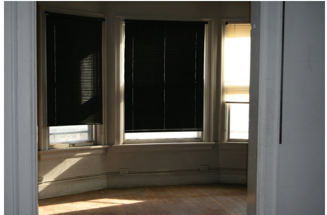
Second Floor Apartment