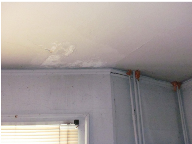
Figure 19. Moisture damage to plaster finishes at the second floor.