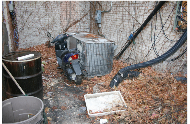
View of space behind existing building showing storm basin collecting water from adjacent buildings