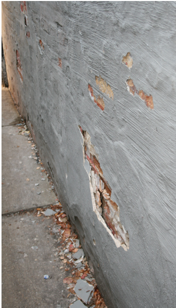
Exterior: View in the alley showing a section of delaminated parging