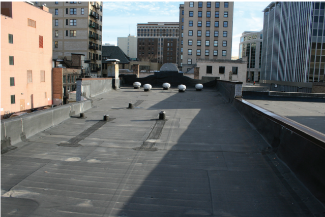
Roof view toward Mifflin Street