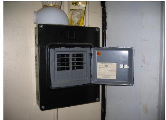
Electrical panel on 2 nd floor.