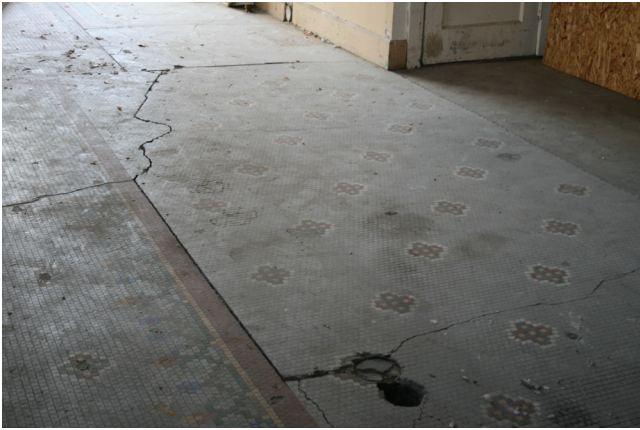
First Floor: View toward basement stair showing multiple cracks in tile floor