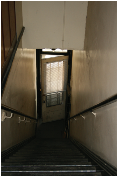
Second Floor: Access from Mifflin Street