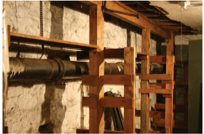
Basement view showing stormline routing storm water from adjacent building(s) through the basement of 120 West Mifflin Street