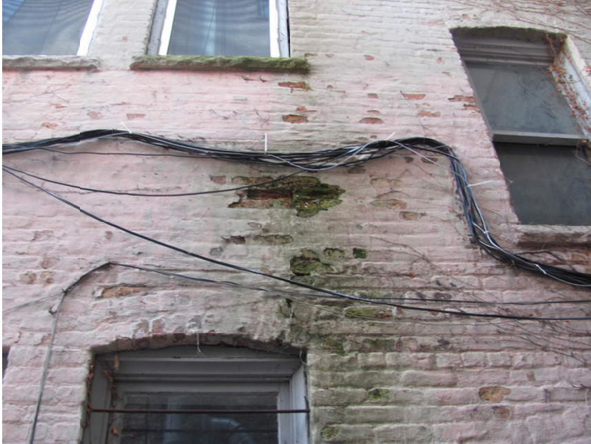
Figure 6. Deterioration of brick masonry at the rear facade.