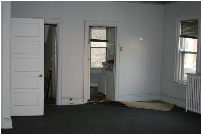
Second Floor Apartment