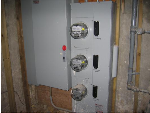
Electrical service in the basement.