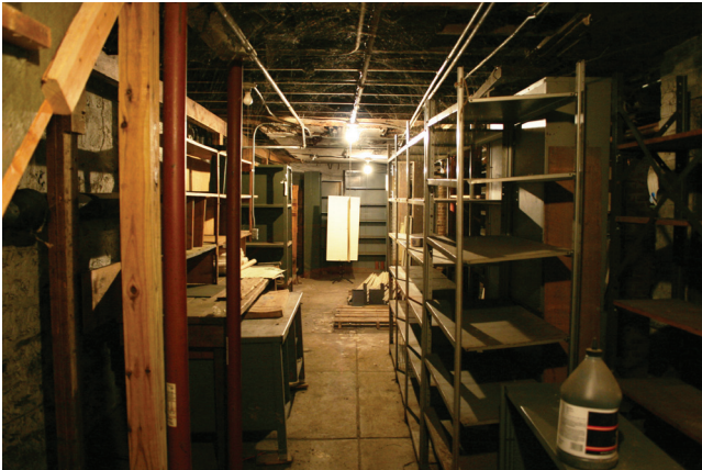
Basement: Temporary shoring to support first floor