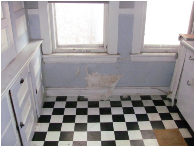
Figure 18. Plaster damage at the rear wall at the second floor of the building.