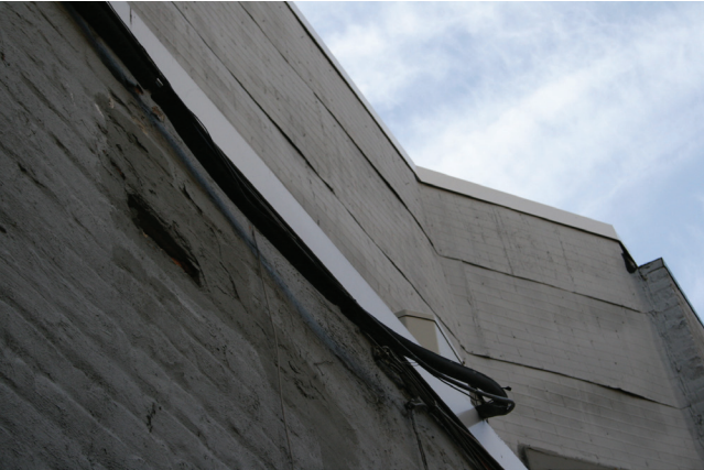
Alley view of sheet metal stamped with brick pattern