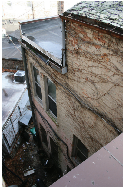
View of the back of facade