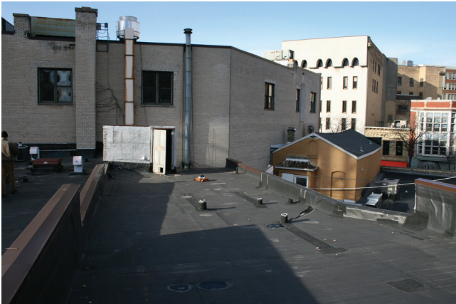
Roof showing roof access structure