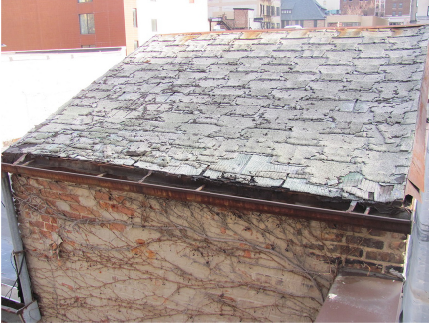
Figure 13. The penthouse roof is covered with asphalt shingles in deteriorated condition.