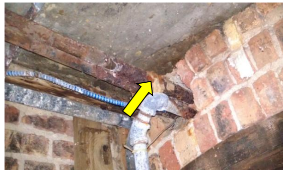
Deteriorated gas pipe