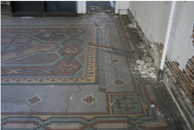
First Floor: View toward back exit showing multiple cracks in floor tile