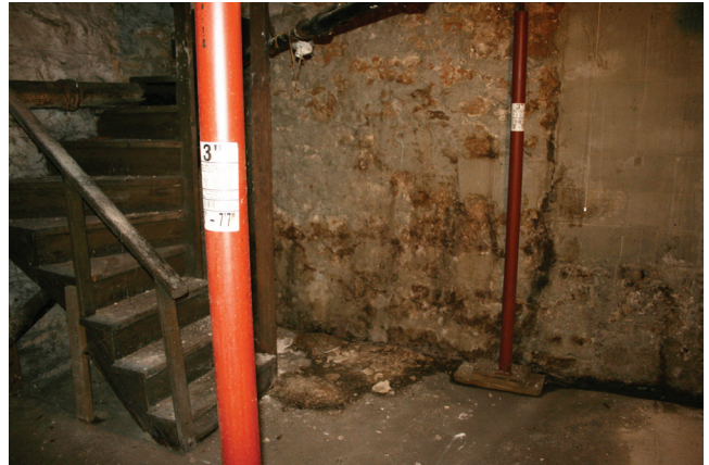
Basement: Temporary shoring to support first floor