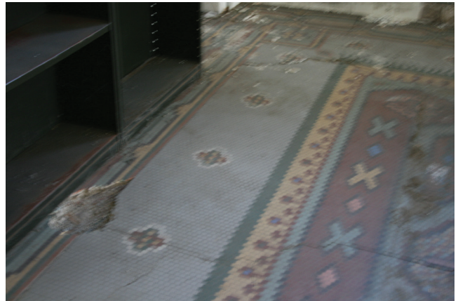
First Floor: View at back of room showing areas where tile floor has been removed