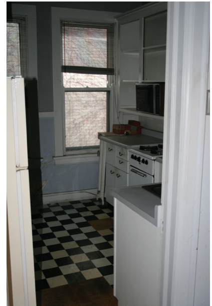
Second Floor Apartment