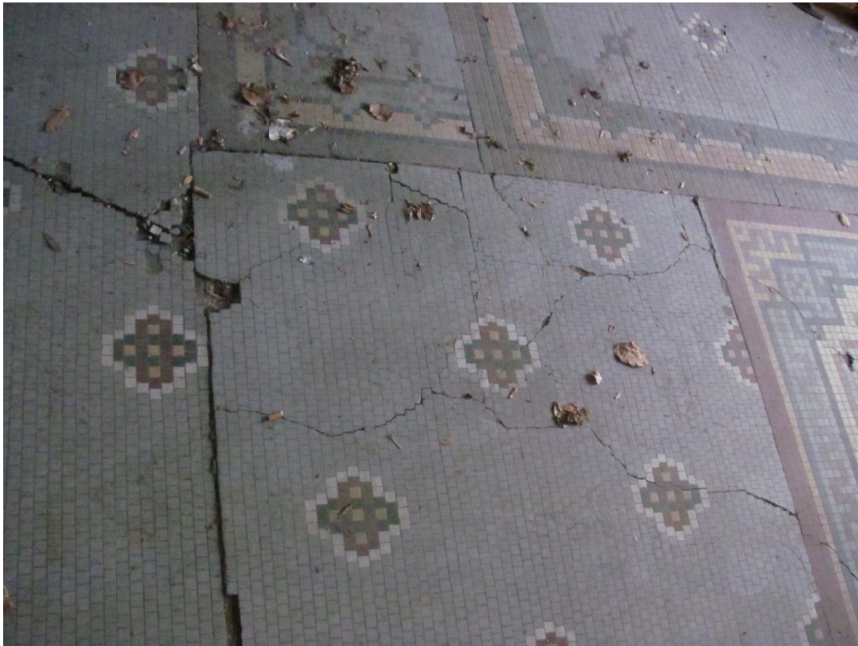
Figure 14. There is elaborate mosaic tile flooring at the first floor; the flooring has suffered extensive cracking and displacement.