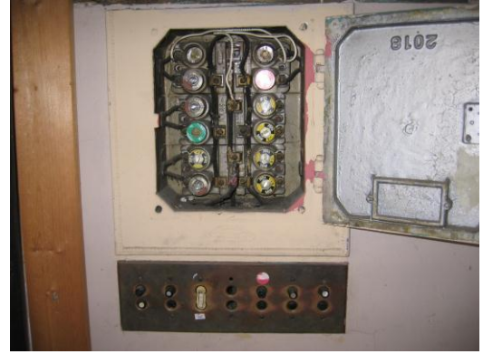
Electrical fuse panel on 1 st floor.