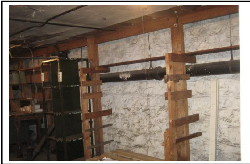
Figure 1 – Shoring along basement wall –also used a s shelving.