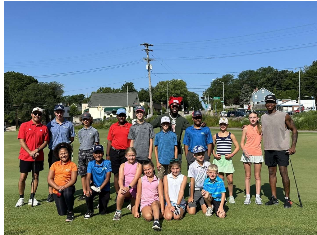
2024 VibeZ Golf/ First Tee Outing