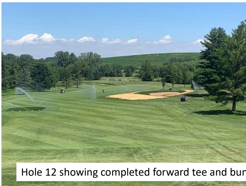
Hole 12 showing completed forward tee and bunker