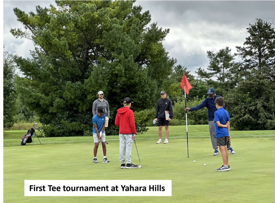
First Tee tournament at Yahara Hills