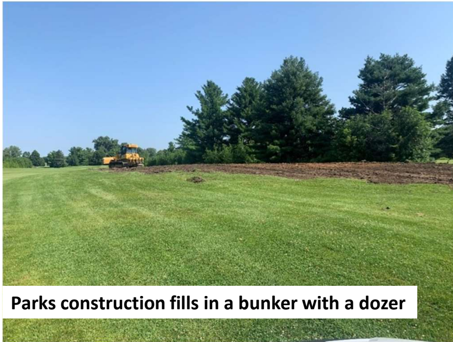
Parks construction fills in a bunker with a dozer