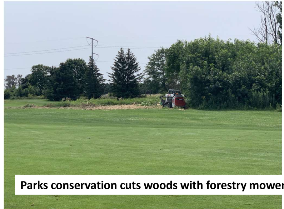
Parks conservation cuts woods with forestry mower