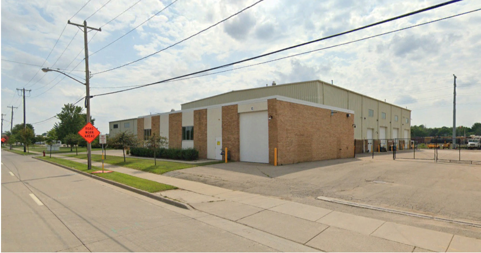
Adjacent Hooper Corporation Building