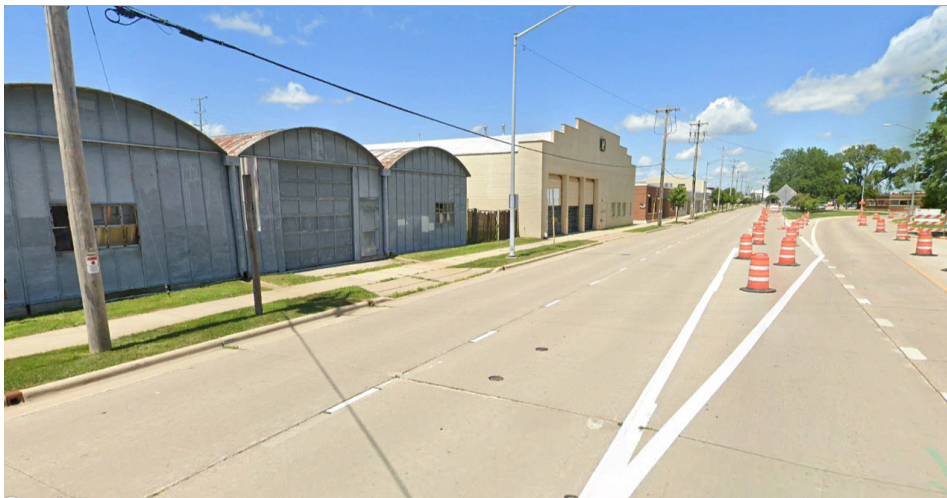
Industrial corridor of Pennsylvania Avenue