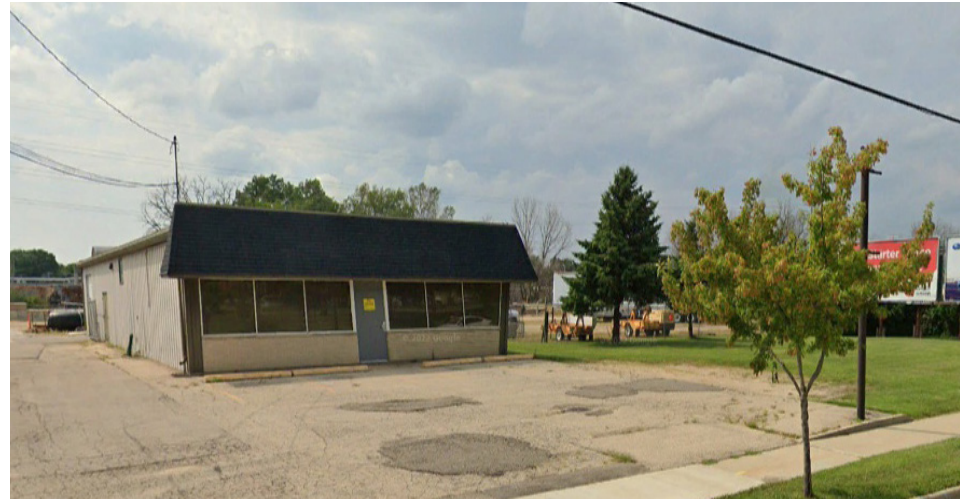
Adjacent 5Nines Storage Office