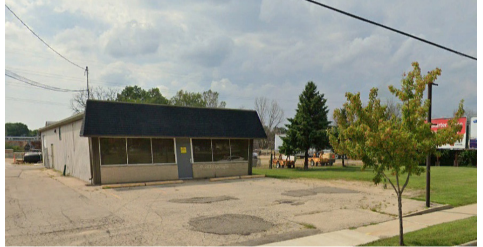
Adjacent 5Nines Storage Office