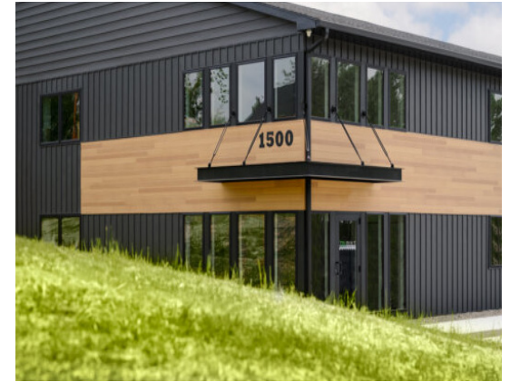
Coal facade on commercial building