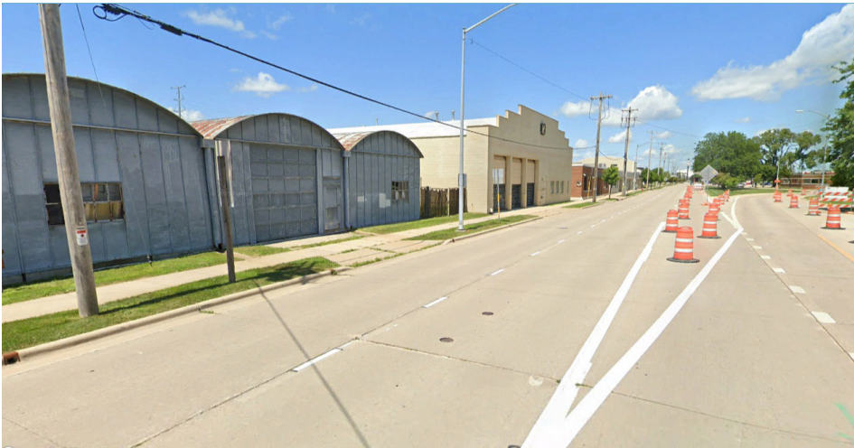
Industrial corridor of Pennsylvania Avenue