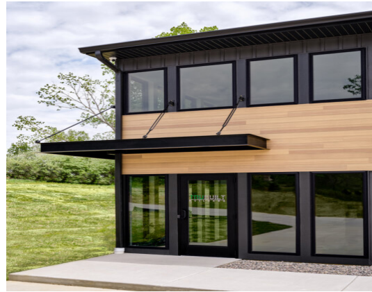
Coal siding used on commercial building