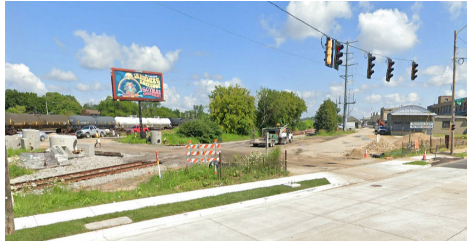
Disruptive railroad crossings