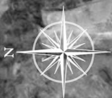
EXHIBIT B EASEMENT DESCRIPTION MAP 20' WIDE EASEMENT - 10' EACH SIDE OF CENTERLINE

BEARINGS REFERENCED TO THE WISCONSIN COUNTY COORDINATE SYSTEM (DANE COUNTY) NAD 83 (2011) 2010 AERIAL PHOTO