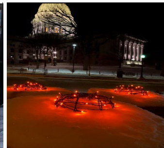
New Decorative Lighting