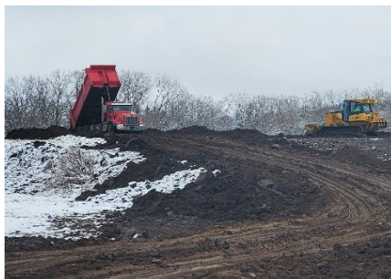
Top Soil Storage