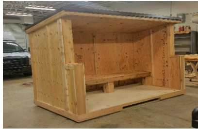
Wexford Warming Bench