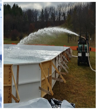
Filling Elver Hockey