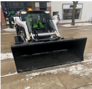
Snow Removal Operations

Support was provided to the Downtown District Committee with their evaluation of converting part of State Street to a pedestrian mall. The proposal could add attractive options for State Street, but any plan would need to address access for trash and recycle collection on State Street and hopefully fund any added work resulting from the change. A number of City Agencies provided input with Parks Operations specifically focused on the maintenance impact.