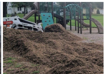
Adding Playground Mulch