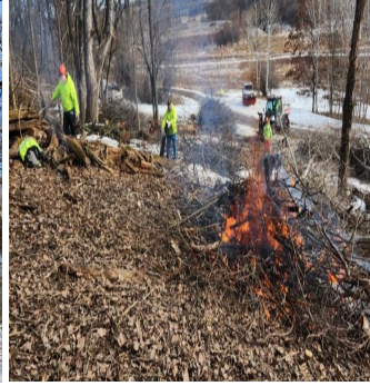
Door Creek Restoration