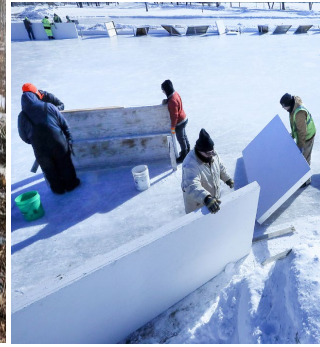
Vilas hockey board