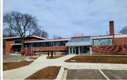
Parks Olin Facility