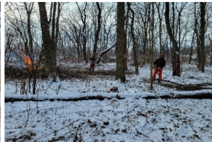
Elvehjem understory restoration - this oak can now reproduce