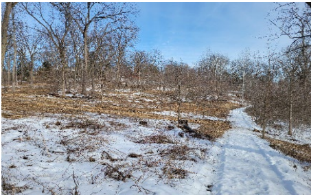
Kettle Pond forestry mowing

Large scale contracted projects included removal of the invasive woody understory from the oak woodland at Elvehjem Sanctuary, forestry mowing encroaching brush in and around prairie habitat at Kettle Pond, canopy thinning to increase light to necessary levels in oak woodlands at Owen and Knollwood, and invasive shrub removal at Sandburg Woods and Moraine Woods. At Owen and Knollwood, downed woody debris was also removed or reduced to volumes that support wildlife habitat while allowing sustainable and required management with prescribed fire.