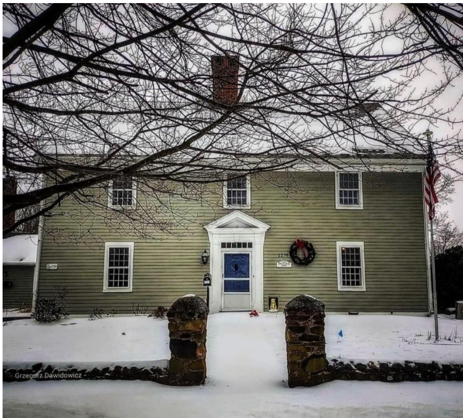
Berlin, Connecticut 1720.