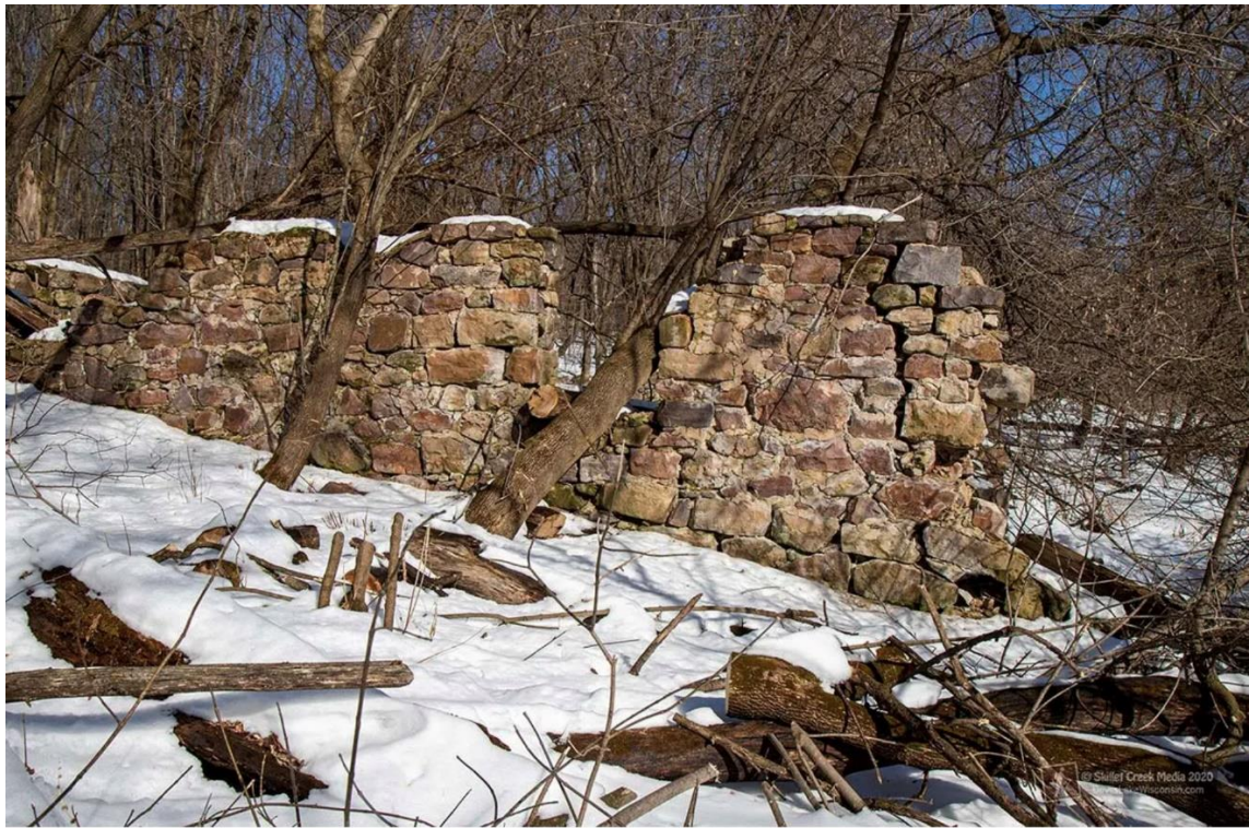
Devil's Lake State Park