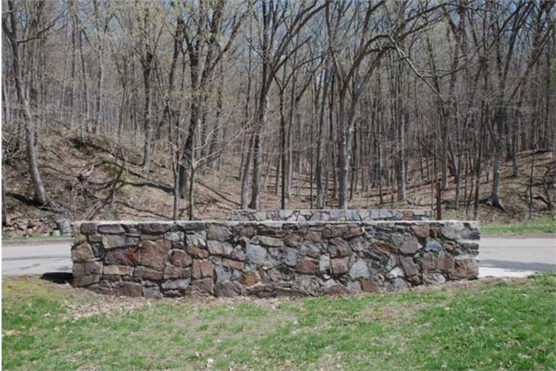
Devil's Lake State Park