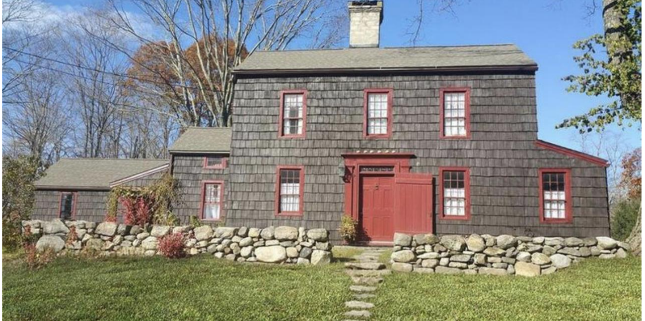
New Canaan, Connecticut 1735.