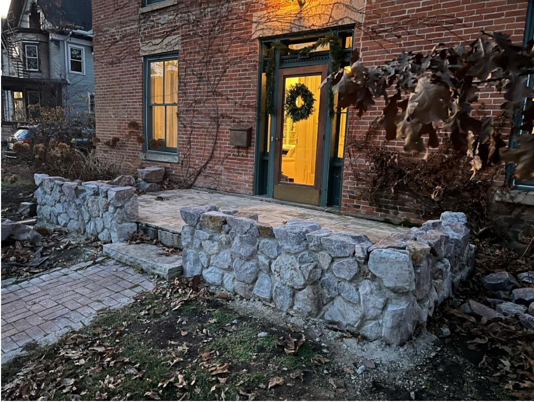
Existing Patio Wall