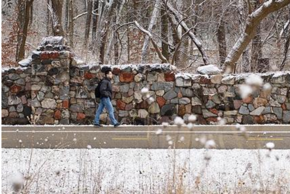
Picnic Point, UW-Madison