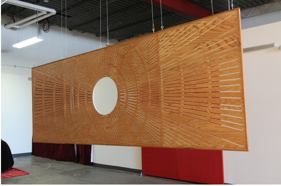
LUX R-8815 2013 CNC cut plywood