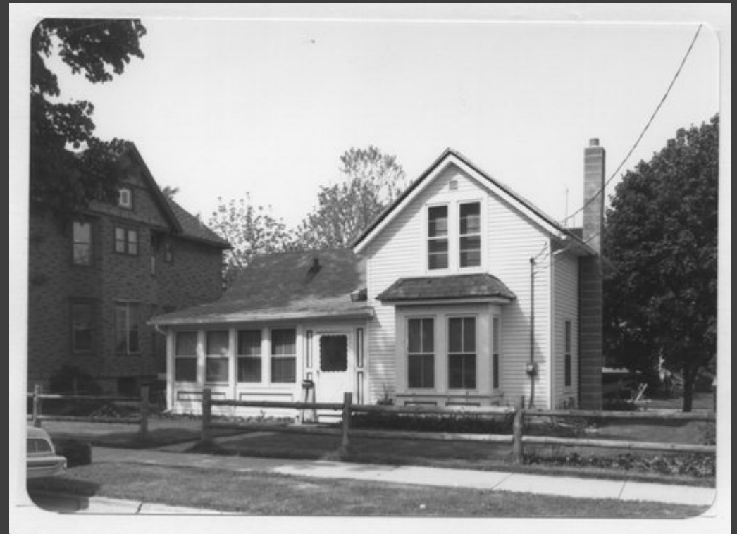
1984 survey photo