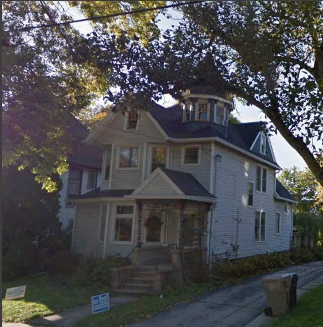
1232 Spaight St.