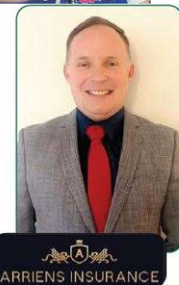
- Dunca's Dog Daycare (top), Triple Double Logistics (bottom left), and Arriens Insurance (bottom right).