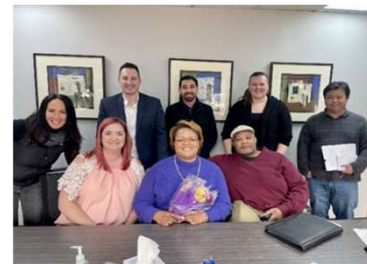
- Thrill Factory (left) and Fringe Salon Spa LLC (right)