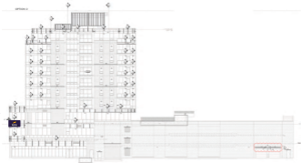
Scale: 1/8" = 1'-0"