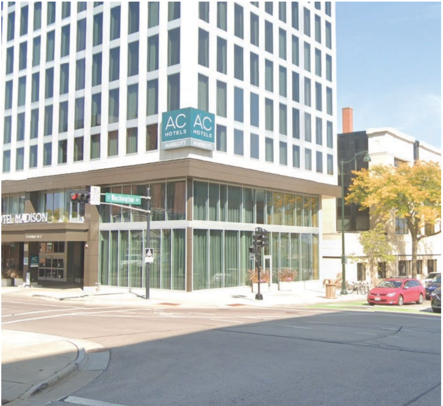
AC Hotel - One N Webster St, Madison, WI 53703