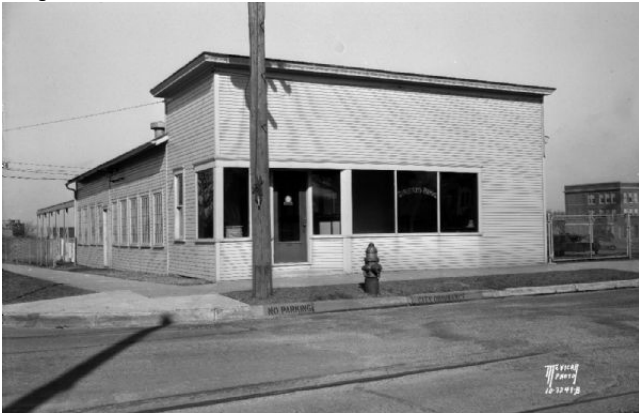
Wisconsin Historical Society