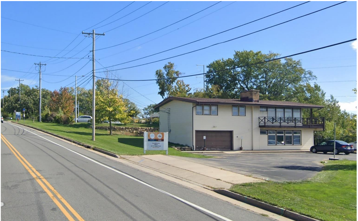
655 West Badger Road

Buildings of 633 & 655 Badger Road in the foreground with existing apartment buildings across Badger Road.