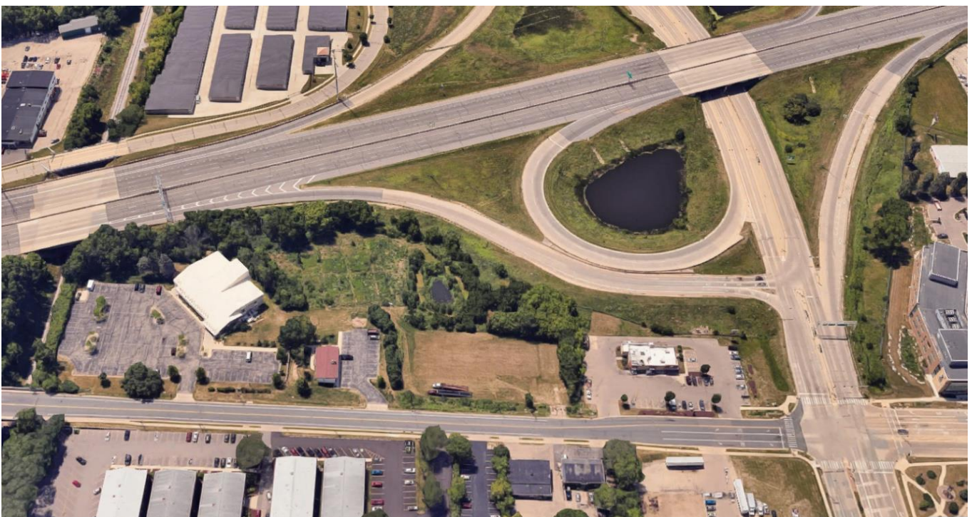
Aerial Image #3