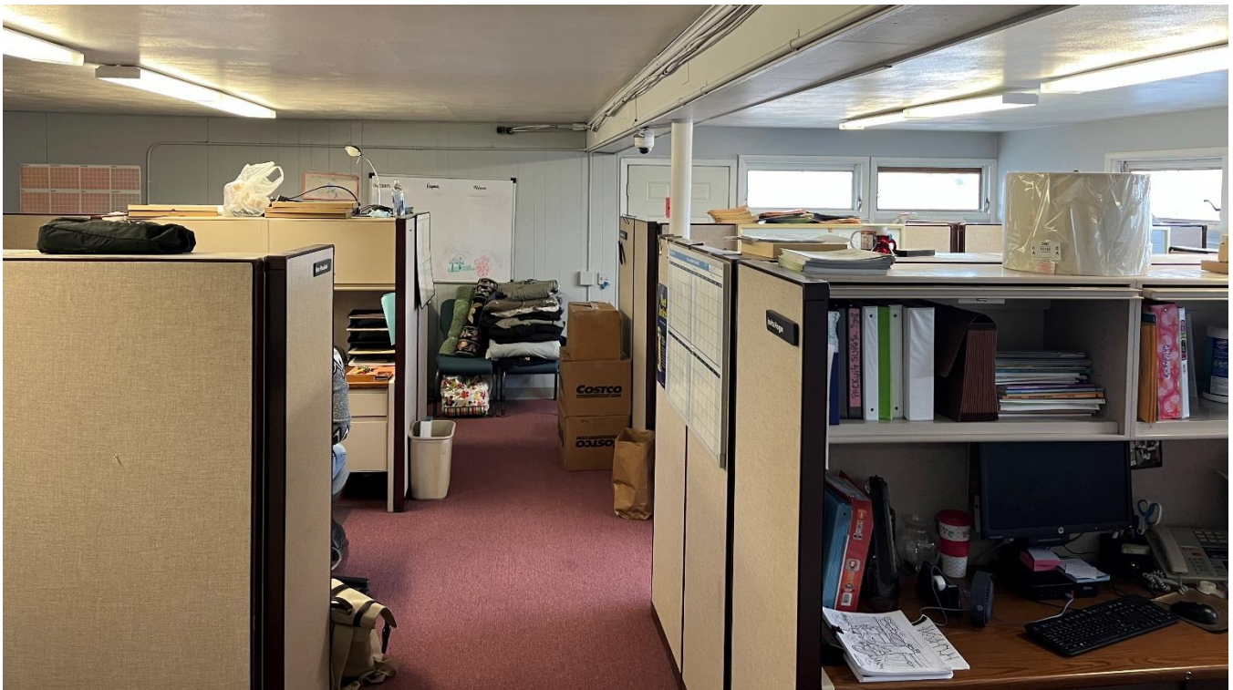
655 West Badger Road Interior photos of the two-story building to be demolished.