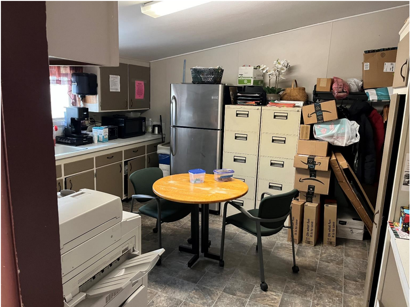
655 West Badger Road Interior photo of the two-story building to be demolished.