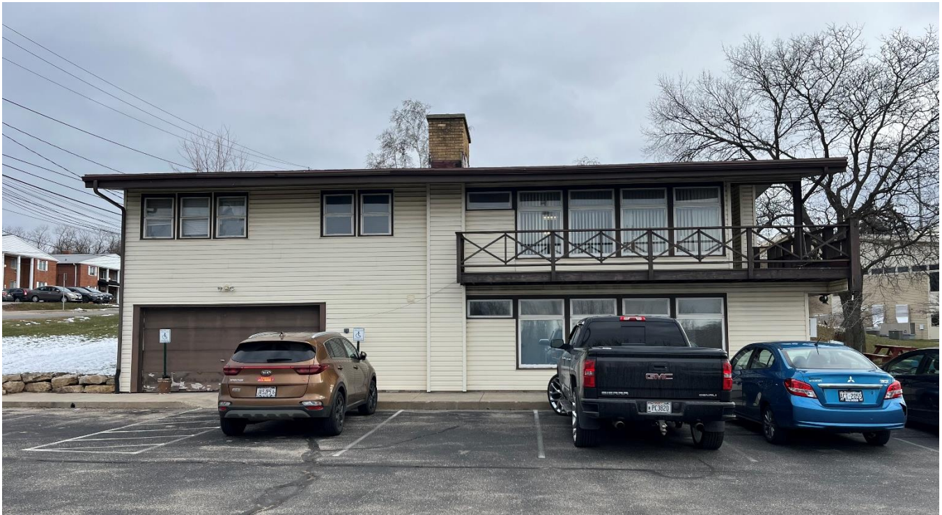
655 West Badger Road West side of two-story building to be demolished.