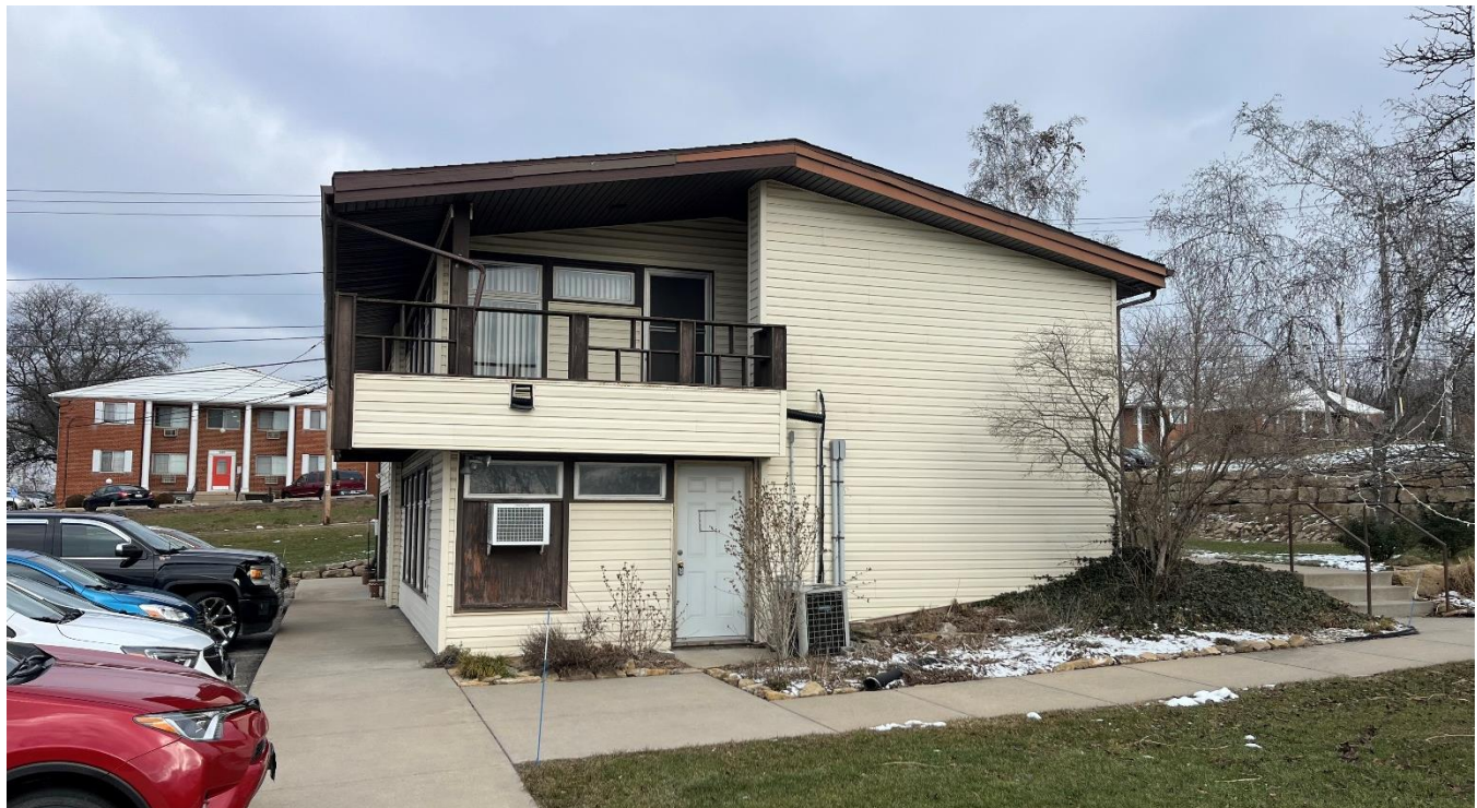
655 West Badger Road South side of two-story building to be demolished.