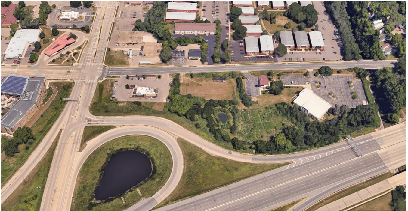
Aerial Image #2