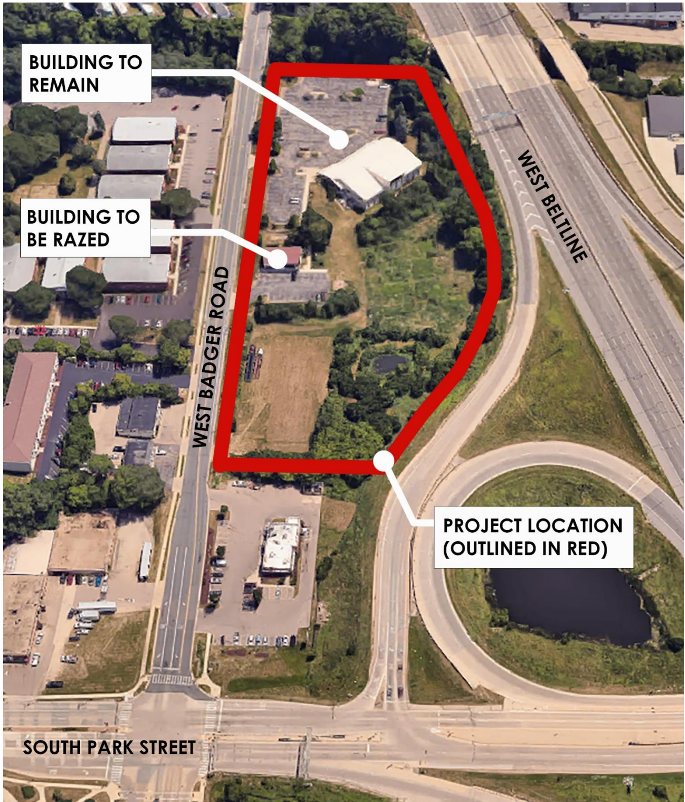
Aerial Image #1