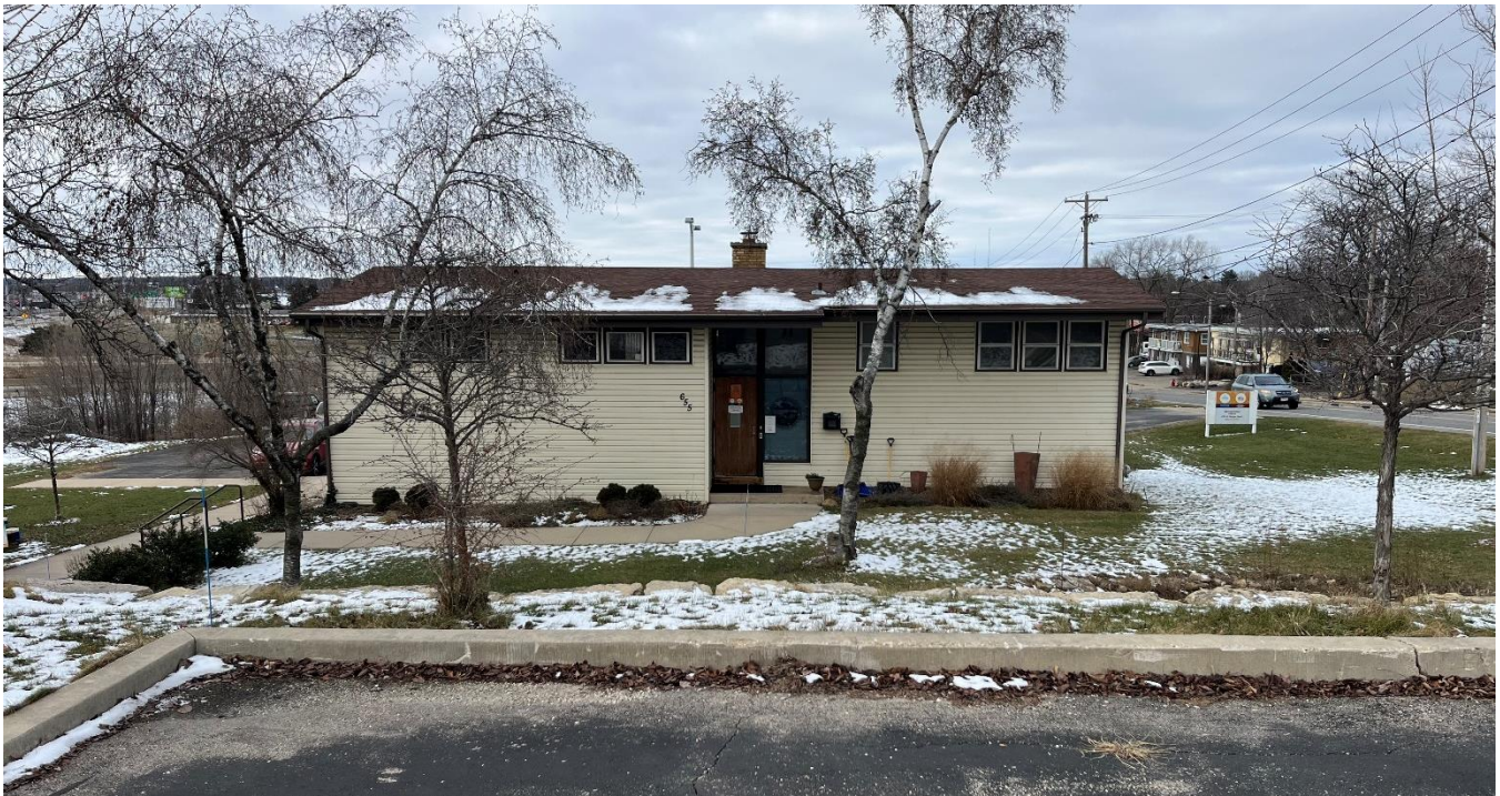
655 West Badger Road East side of two-story building to be demolished.