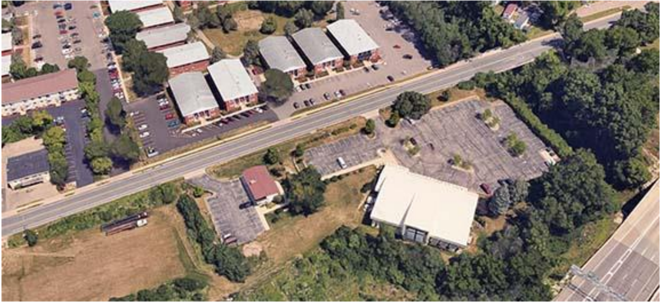
Aerial Image #4

Buildings of 633 & 655 Badger Road in the foreground with existing apartment buildings across Badger Road.