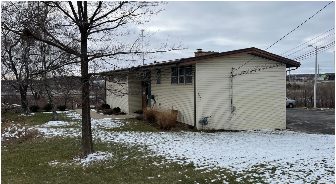
655 West Badger Road North side (and east side) of two-story building to be demolished.