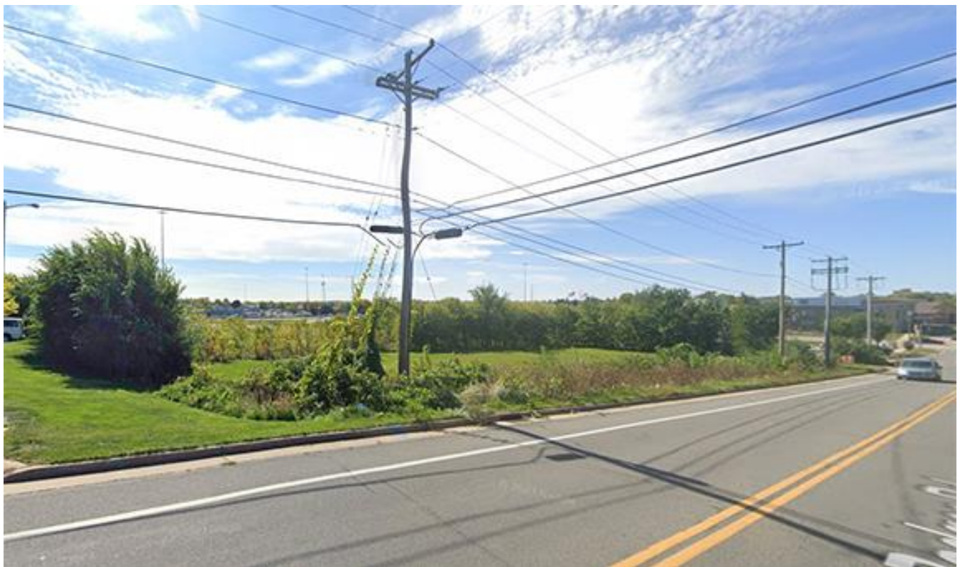
711 West Badger Road

Looking southwest down West Badger Road – Two story building to be demolished