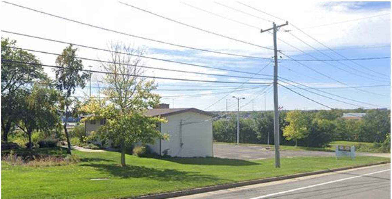
655 West Badger Road

Looking southwest down West Badger Road – Two story building to be demolished