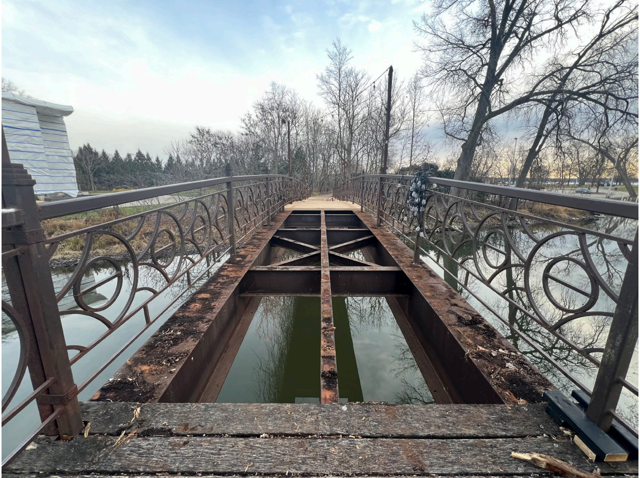
Figure 2: Thai bridge in middle of repair work.

Work continues on the Royal Thai Pavilion. The roof repairs are complete with the exception of installing the tiles. The tiles are in transit to the United States, with an expected arrival date of January 12, 2024. Once here, they anticipate it will take approximately 2 weeks to install the roofing tiles. A public tile-signing day is tentatively planned for the end of January, where the public can sign the underside of a tile with words of peace and hope.