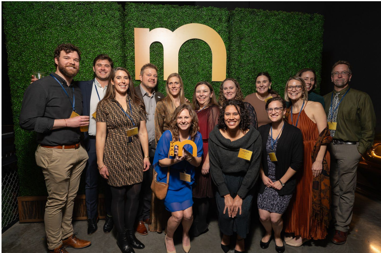
Figure 1: Olbrich Gardens staff accepted the Destination Madison award.

Destination Madison celebrated their 50 th anniversary on November 29, 2023. As part of their celebration, they hosted a variety of awards for the hospitality and tourism industries. Olbrich Botanical Gardens received the Herb and Sylvia Frank Visionary Award . This award recognizes a business or organization that has made exceptional achievements in providing valuable services or products to Madison's visitor economy while simultaneously enhancing the quality of life for residents.