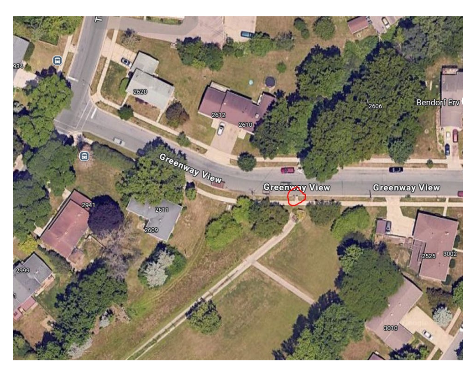
Design: The final design will include text in Spanish.

1. Location: WI EcoLatinos near Leopold Elementary School