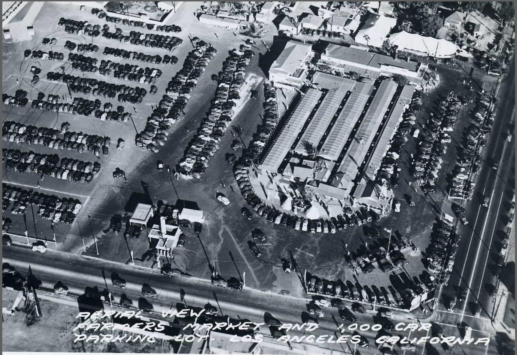
AERIAL VIEW - FARMERS MARKET AND 1,000 CAR PARKING LOT - LOS ANGELES, CALIFORNIA