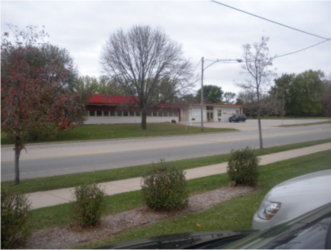
EAST ELEVATION-MAPLE GROVE DRIVE