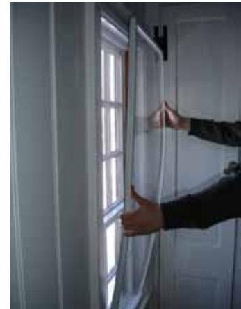
Interior storm panel.

Several retrofit measures perform as well as new replacement windows. Specifically, interior window panels and the combination of exterior storm windows and cellular blinds essentially match the energy savings of new, efficient replacement windows. (See energy savings comparison chart on Page 3.)