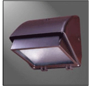
L2: COOPER LIGHTING-WALLY CUTOFF 9"x9" 70 W METAL HALIDE