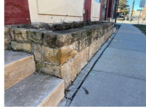
805 Williamson Street