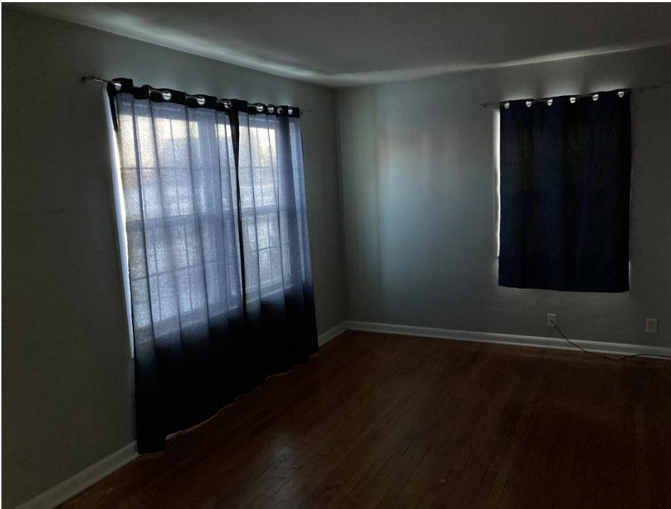
View of living room