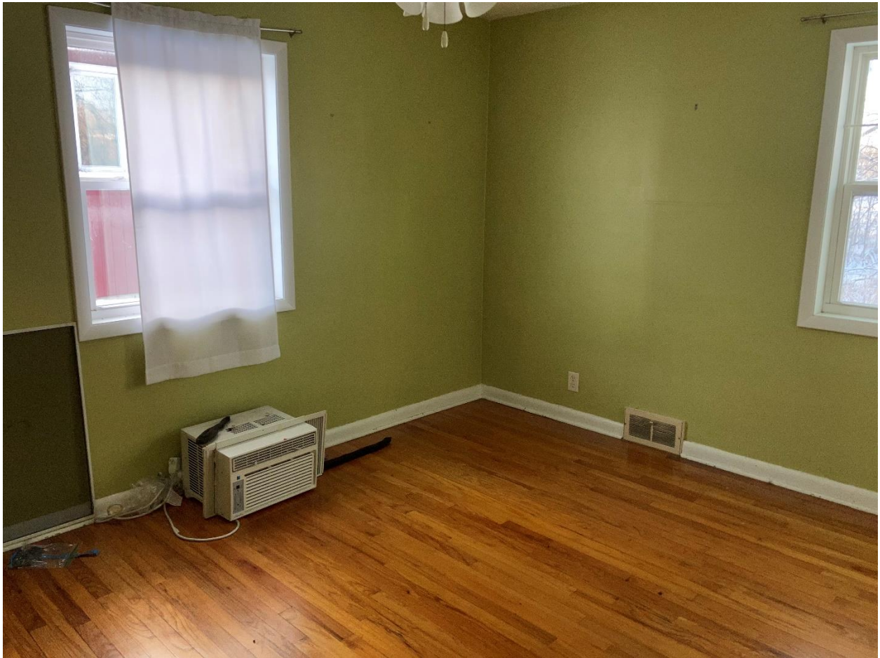
One of the bedrooms