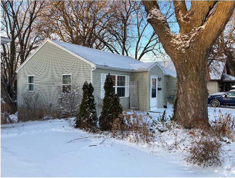
View of exterior